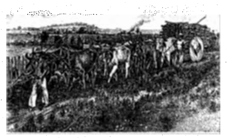
Figure 4 Large team of oxen hauling a cartload of logs, not necessarily for fuel. Note the smoke rising on the horizon. Drawing by Percy Lau reproduced with permission from the Instituto Brasileiro de Geografia e Estatistica, Rio de Janeiro, Brazil.

Through much of the colonial period, nature's abundance was the strongest argument against attempts at conservation.