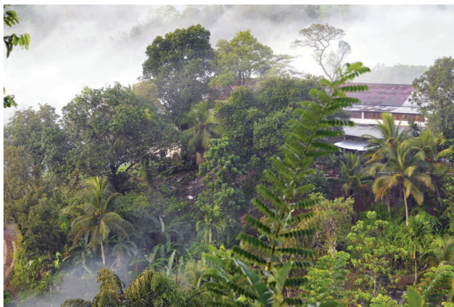
Tropical rain forest, Sinharaja, Sri Lanka. In recent decades, views of the relationship between humans and nature have changed in tandem with increasing impacts of human activities on natural systems.

life, stem from this period (4) and persist to the present.