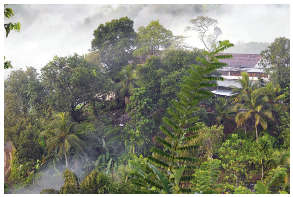
Tropical rain forest, Sinharaja, Sri Lanka. In recent decades, views of the relationship between humans and nature have changed in tandem with increasing impacts of human activities on natural systems.

threats to species and habitats from humans, and on strategies to reverse or reduce them. Ideas concerning minimum viable population sizes and sustainable harvesting levels, as well as intense debates about community-based management and the sustainable use of wild-