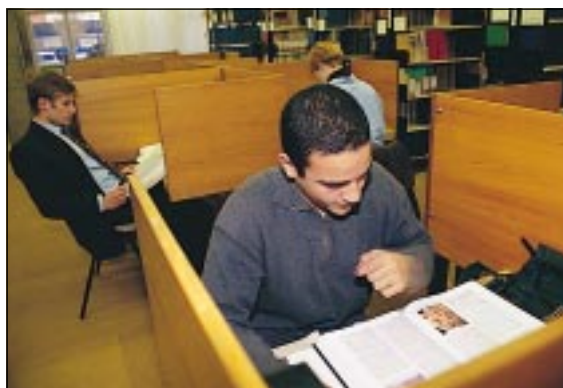
Are these results credible?