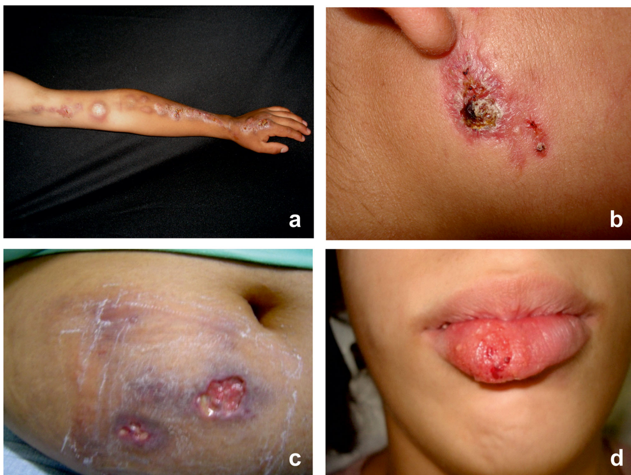
Figure 1. Different clinical presentations of sporotrichosis. (a) Lymphocutaneous sporotrichosis, (b) fixed cutaneous sporotrichosis, (c) ulcerating lesions in a patient who slept with her cat, (d) oro-labial sporotrichosis in a patient who kissed her cat.

In 1979 Kwon-Chung first reported the heterogeneity of Sporothrix schenckii sensu lato strains. She noted that the isolates from lymphocutaneous and fixed cutaneous (Fig. 1a, b) forms of disease differed in their growth at