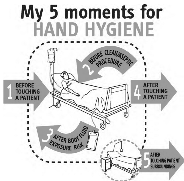
FIGURE 1. The “My 5 moments for hand hygiene” concept (adapted from Sax et al. 4 ).

care is delivered either to a patient or to a specific group in a population and in all settings where health care is permanently or occasionally performed, including home care by birth attendants.