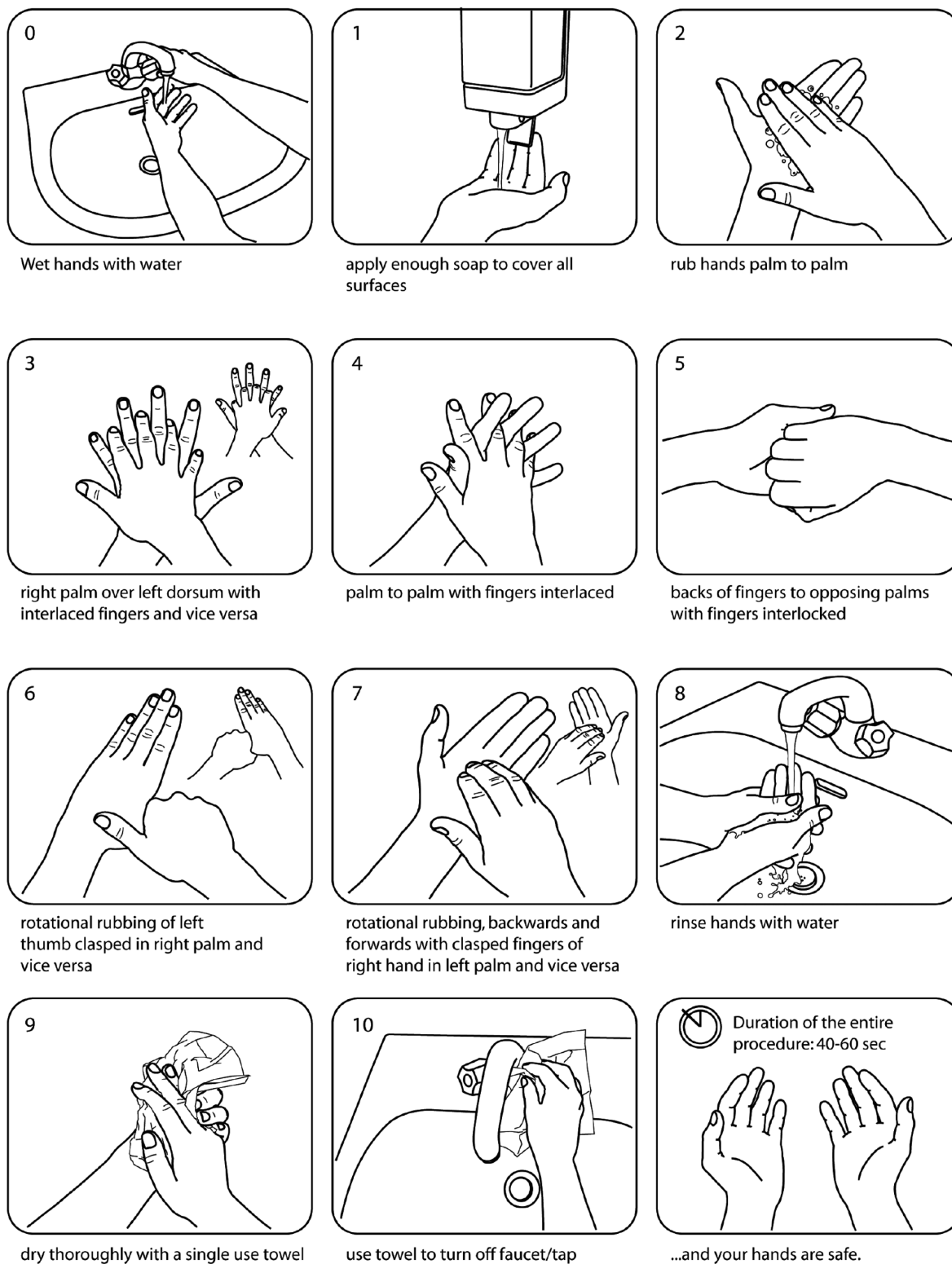
FIGURE 2B. Handwashing technique with soap and water. 3