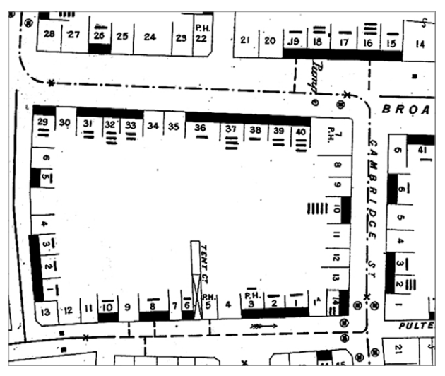
Figure 3: Edmund Cooper's map for the Metropolitan Commission of Sewers, September, 1854 Dark bar along street frontage indicates house in which death occurred;

In his report, Cooper added: "Since the outbreak, six men have been employed in these lines of sewers getting up information on this subject, all of whom, I am glad to state, are quite healthy, and entirely free from disease."<sup>12</sup> Thus, he suggested, sewer gases were unlikely to spread cholera.