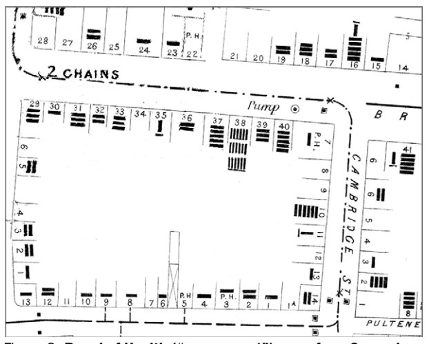
Figure 2: Board of Health ("government") map, from General Board of Health