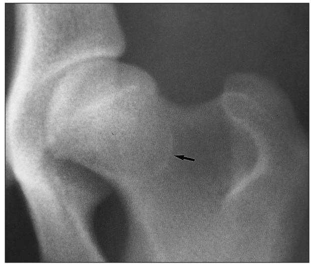
Figure 1—Ventrodorsal radiographic view of a caudolateral curvilinear osteophyte (arrow) on the femoral neck of a dog with otherwise good hip joint conformation.

Radiographic signs of degenerative joint disease (DJD) such as subchondral bone sclerosis, periarticular osteophytosis, and joint remodeling have