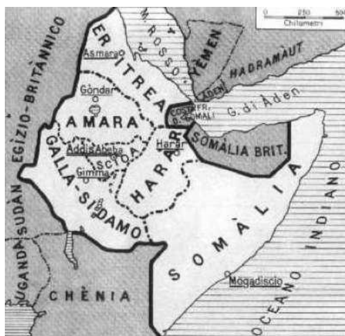
Italian residents in the AOI in 1939