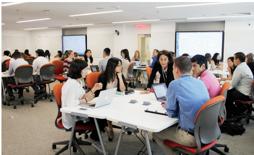
Faculty and Students Interacting in Learning Studios at Harvard Medical School.

In the “Pathways” curriculum, students focus on the application of concepts to solve clinical problems. Selected lectures remain in most courses to create frameworks for subsequent learning.