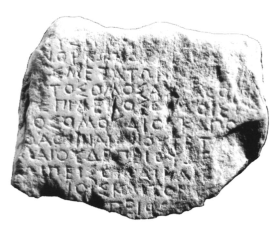
(a) IG I<sup>3</sup> 39, Athens and Eretria