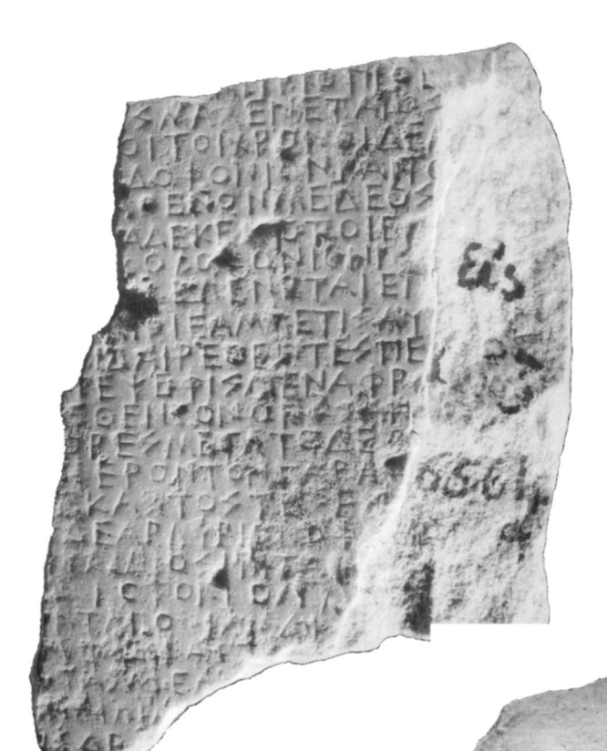
(b) IG I<sup>3</sup> 37 (ML 47), fragment A Athens and Colophon (photograph: Athens, Epigraphical Museum; EM 6564a)