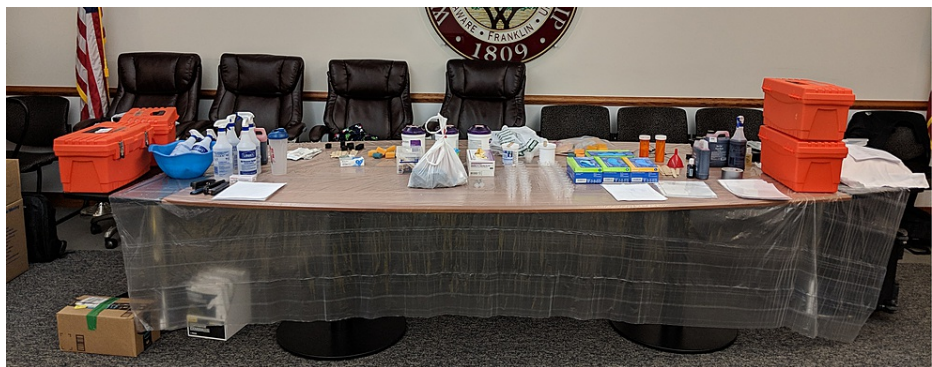
FIGURE 4: Draped Table

Lastly, SPs were staged by directing them to the designated zone of their respective scenario. A reset period, between scenarios, allowed for moulage adjustments and touch-up.