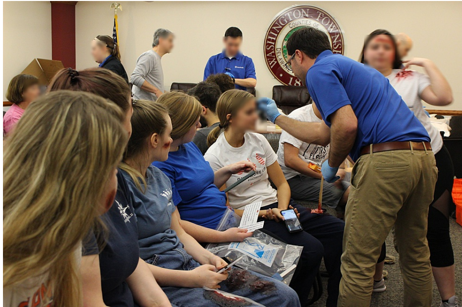
FIGURE 3: Moulage Assembly Line