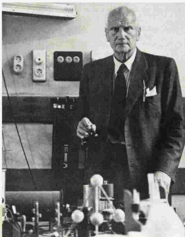
Figure 3. Walther Gerlach (1889–1979), cigar in hand, in his laboratory at the Institute for Physics in Munich, about 1950.

He recognized that, according to the Bohr model, the space quantization should be only twofold, as the projection of the orbital angular momentum was limited to \pm h/2\pi (although Bohr, among others, had become uneasy that his model excluded a zero value). The twofold character made feasible a decisive test of spatial quantization using magnetic deflection of an atomic beam. Despite the smearing effect of the velocity distribution, in a strong enough field gradient the two oppositely oriented components should be deflected outside the width of the original beam. Classical mechanics, in contrast, predicted that the atomic magnets would precess in the field but remain randomly oriented, so the deflections would only broaden (but not split) the beam. Thus, Stern thought he had in prospect an experiment that, “if successful, [will] decide unequivocally between the quantum theoretical