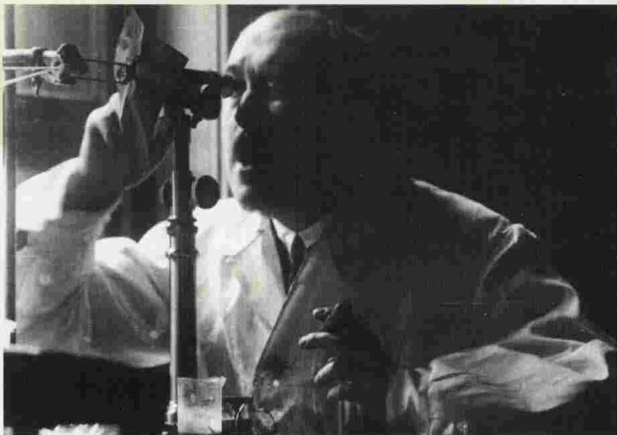
Figure 2. Otto Stern (1888–1969), cigar in hand, working in his molecular beam laboratory at the Institute for Physical Chemistry in Hamburg, about 1930.

Copenhagen said to me in a friendly manner, “You look very unhappy,” whereupon I answered fiercely, “How can one look happy when he is thinking of the anomalous Zeeman effect?” 6