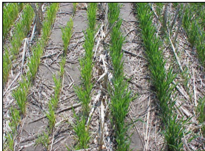
Figure 11.2. Nitrogen deficiency in wheat (N deficient rows on left with N sufficient rows on right).

Wheat requires N to produce organic molecules like amino acids, proteins, and nucleic acids. Pale green plants are indicative of N deficiencies (Fig. 11.2). Other symptoms include chlorosis (yellowing), which commences on lower leaves beginning at the leaf tips and works inward, reduced tillering, stunting, poor kernel fill, and low grain protein.