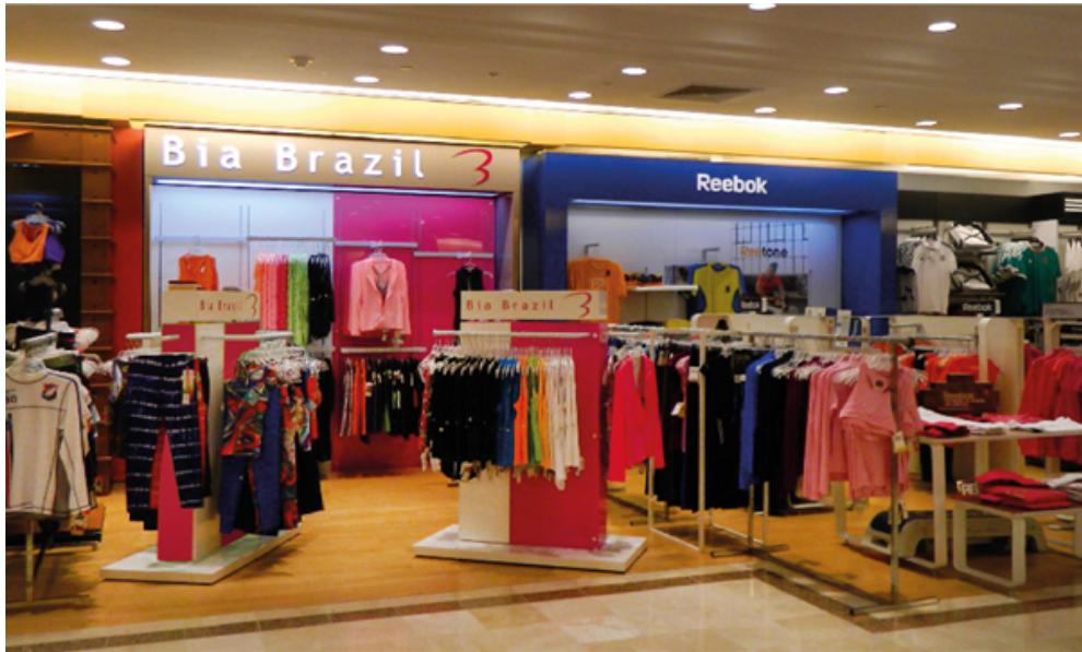
Figure 2. Bia Brazil corner in a department store.