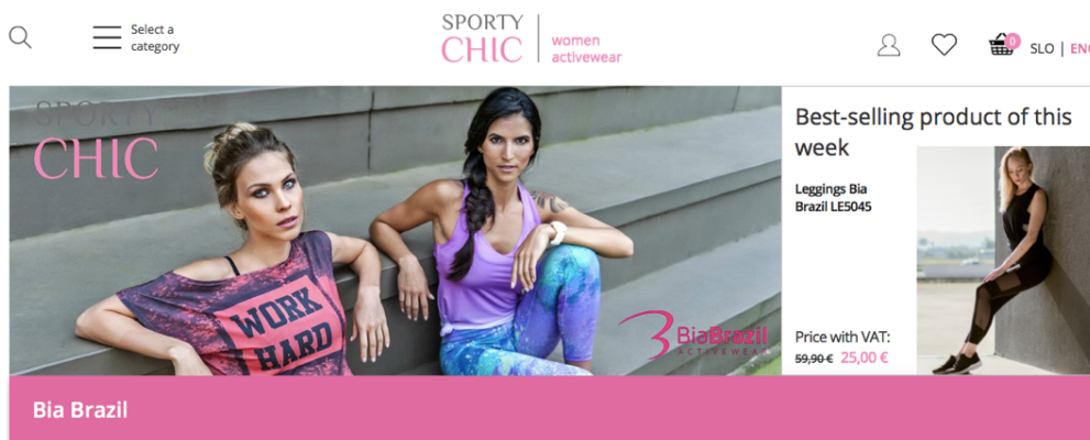
Figure 3. Bia Brazil's client website.

In addition, the company has a showroom in the United States and Portugal. Initially, the unit in the United States was focused on B2B and has been managed by their first client in the United States. In 2019, they opened a showroom focusing on B2C. The one in Portugal is managed by Bia Brazil and was opened focusing on the whole European market. A third showroom opened in Dubai in 2020. In the future, the company is planning to turn this showroom as a hub for the world. The idea is to have just one website, where the clients will identify their country, and be directly connected with one of these hubs.