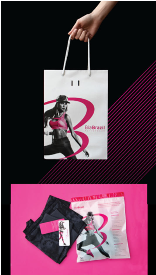
Figure 4. New brand strategy.

Over the years, the company has received many awards, notably: