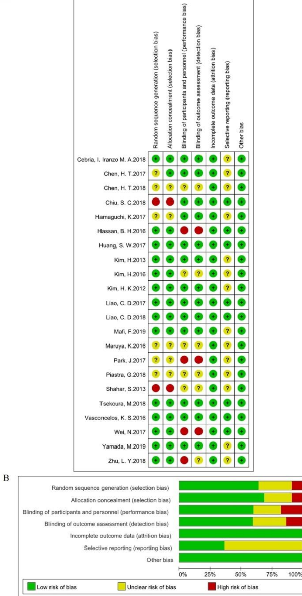
Figure 6. Assessment of risk of bias based on the Cochrane risk-of-bias tool. (A) Risk of bias graph; (B) risk of bias summary.