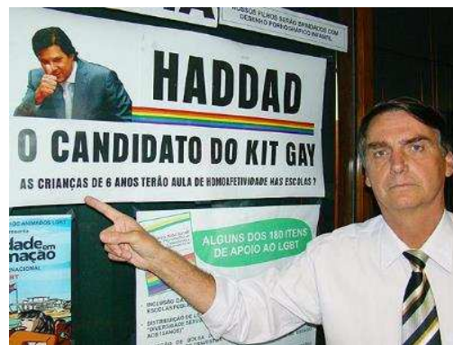
Figure 3: The so-called gay kit program by Jair Bolsonaro never saw the light of day in public schools. It refers to the project called School without Homophobia that sought to train teachers in LGTB rights to prevent violence and promote respect for diversity among young people and adolescents.

An IDEA/Big Data Avaaz poll noted that 83.7% of Jair Bolsonaro's voters believed the information that Haddad distributed the gay kit for children in schools when he was education minister 5 .