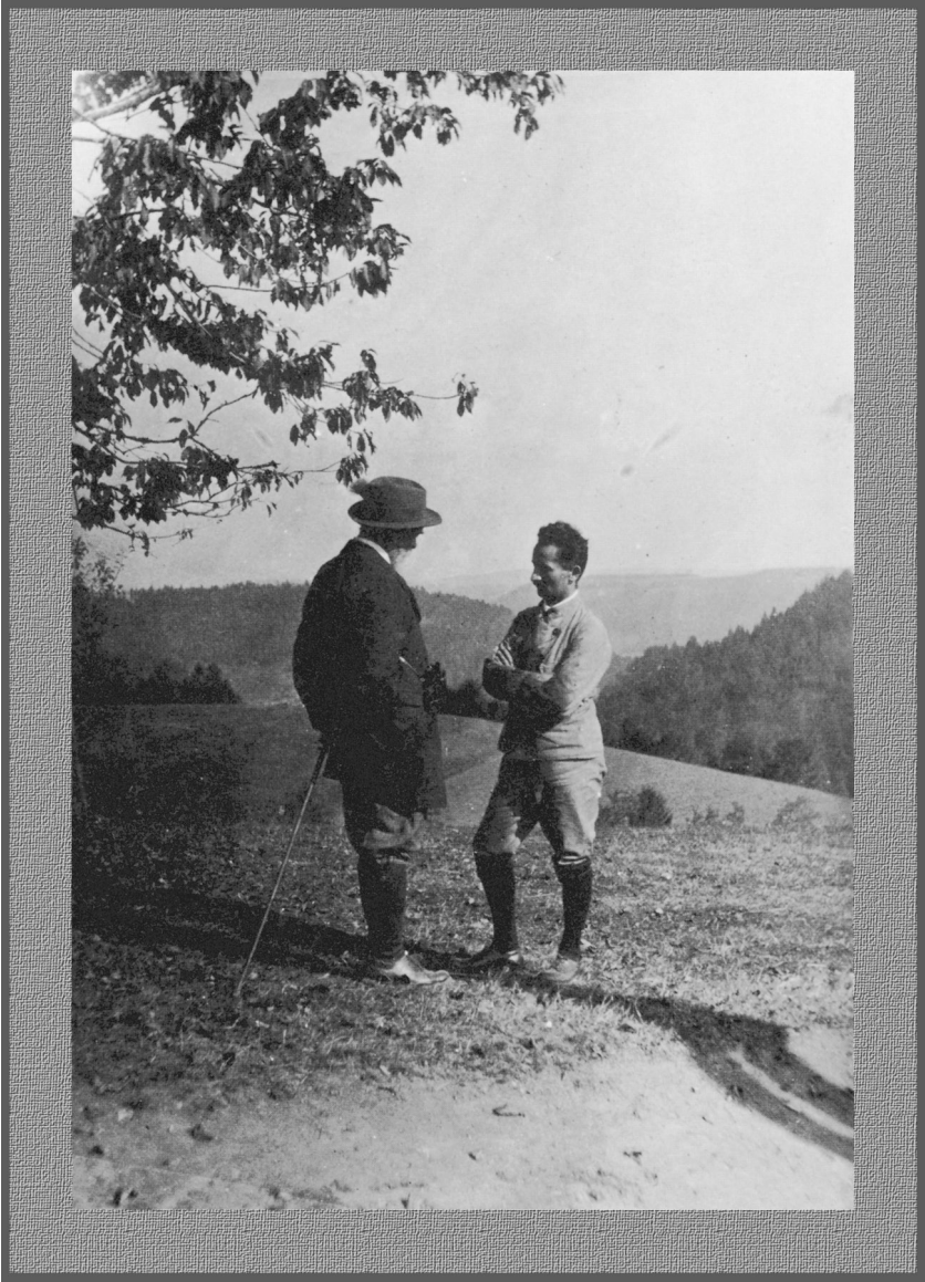
FIG. 6. Husserl und Heidegger 1921.