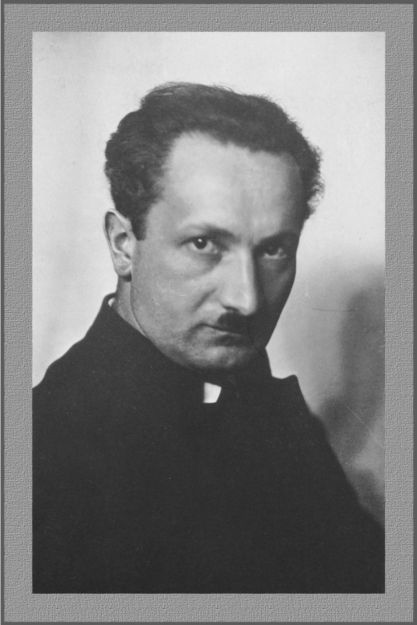
FIG. 5. Martin Heidegger, 1933.