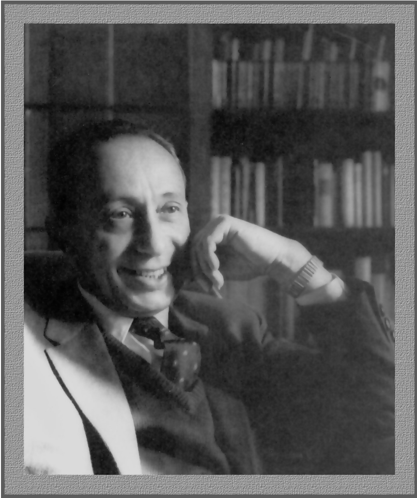
FIG. 3. Hans Jonas, Mönchengladbach, c. 1932.