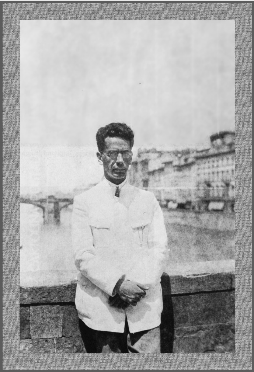
FIG. 2. Karl Löwith, Florence, 1925.