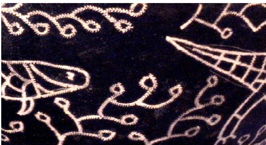
Doc 16 – 19: Engravings applied by a man on gourds previously covered with kumatê paint by his wife.