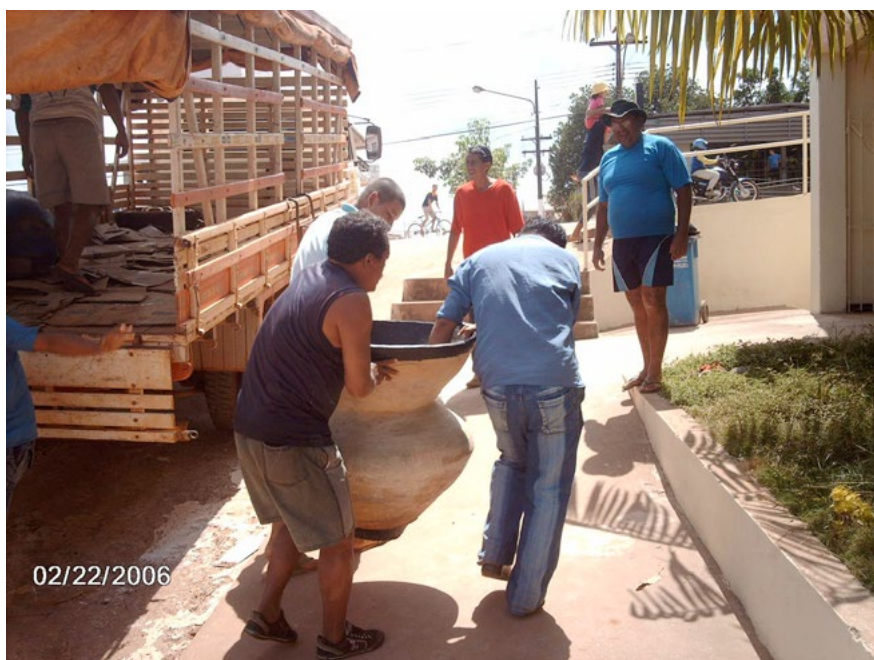
Doc 30: Arrival of the collection at the Kuahí Museum.