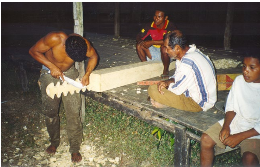
Doc 10: Elderly shaman giving instructions to a young craftsman carving a ritual bench.

with the Indians, sought to encourage the old craftsmen and women, in their own villages and places of traditional production, to transmit to the younger generations their knowledge, information and techniques related to a wide variety of material and immaterial artistic and craft manifestations. The goal was to guarantee the transmission of knowledge that was at risk of extinction, given that only a limited number of people still had this knowledge and most of them were quite old. This project considerably stimulated indigenous craft production in all the villages of the region.