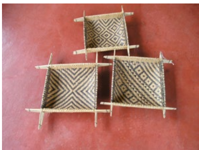
Doc 35. Geometrical symbolic patterns on basketry.