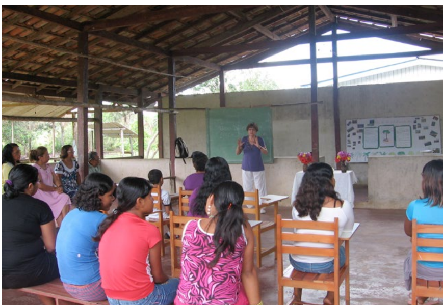
Doc 39: Preparatory workshop of the cross-border exhibit, in the village of São José do Oiapoque.