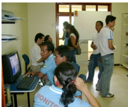
Doc 21: Research room.