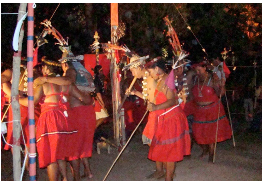
Doc 37: An outdoor turé dance at the inauguration of the exhibit at the Museu do Índio, Rio de Janeiro in 2007.