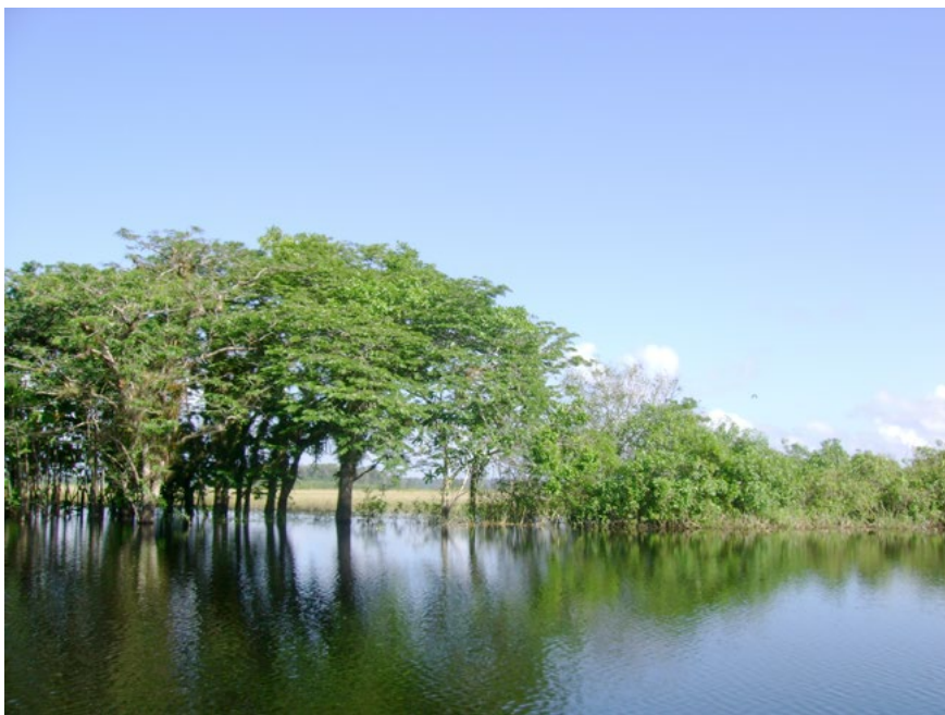
Doc 4.

The landscape typical of the region inhabited by the indigenous peoples of the Oiapoque is a flooded savannah, bathed by three large rivers the Uaçá, the Urucauá and the Curipi, in addition to countless tributaries, igarapés and lakes. The Oiapoque River marks the border between Brazil and French Guyana. The western portion of the indigenous territory has tropical forest with rich vegetation with many palm trees and meets the Tumucumaque Mountains; to the east are the Cassiporé River, Cape Orange and the Atlantic Ocean. The villages and the plantations occupy different islands. It is a region with many birds.