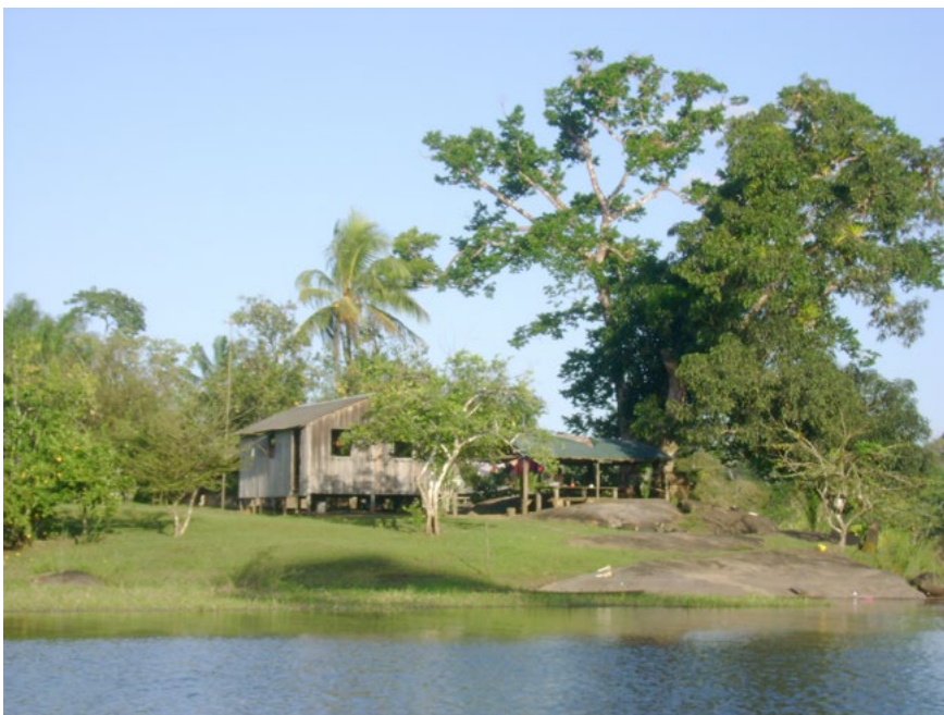
Doc 5. Village on a small island along the Curipi river.

of Oiapoque and even with Saint Georges, in French Guyana, where they sell their agricultural products and artifacts, usually in the street or on the river bank.