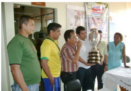
Doc 49 : The America's Cup exhibited in the Kuahí Museum with the presence of local authorities.