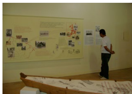
Docs 40 – 41: The indian team of the Museu Kuahí preparing a new exhibit.

interesting material and know another cultural reality.