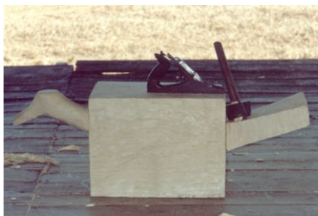
Doc 36. Carving of a shaman's bench representing a bird.

Cultural Revival project APIO/PDPI – MMA. While the elders passed on their knowledge to the younger ones, the artifacts produced were taken to the offices of APIO and stored in a room. They are valuable pieces, many of them experimental and testament to the great effort at the transmission of knowledge among the generations. The collection includes very old pieces that are no longer made, but also innovative pieces, both in terms of form and design. In 2007, this collection was included in the archives of the Kuahí Museum, but as a specific and separate collection, a witness to this work of revival.