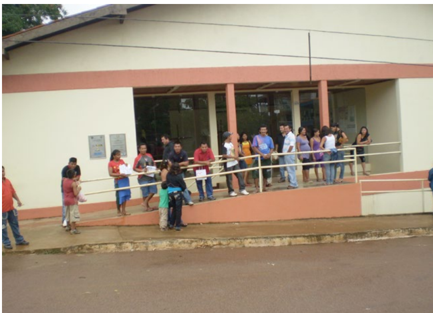
Doc 52: Visitors meeting in front of the Museum.