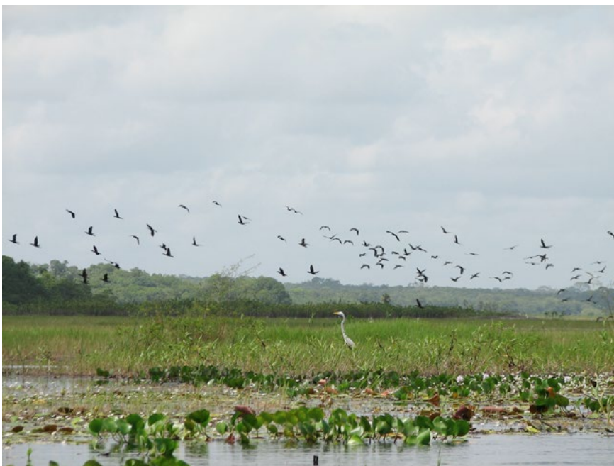
Doc 3. Birds and heron in the flooded savannah.

Over time these people have been able to coexist and construct a space for interlocution, particularly through their annual assemblies, which bring together the four ethnicities and their indigenous organizations. Despite their differences, a visible solidarity prevails among these people because they inhabit a single territory, they experience a common geopolitical situation, and maintain and reactivate relations of kinship and mutual assistance, as well as struggle together for land, healthcare, education, and infrastructure. They share a specific indigenous cosmology, which is Carib, Aruak, Tupi and also Christian, a distinctive factor that the Indians define as “our system.”