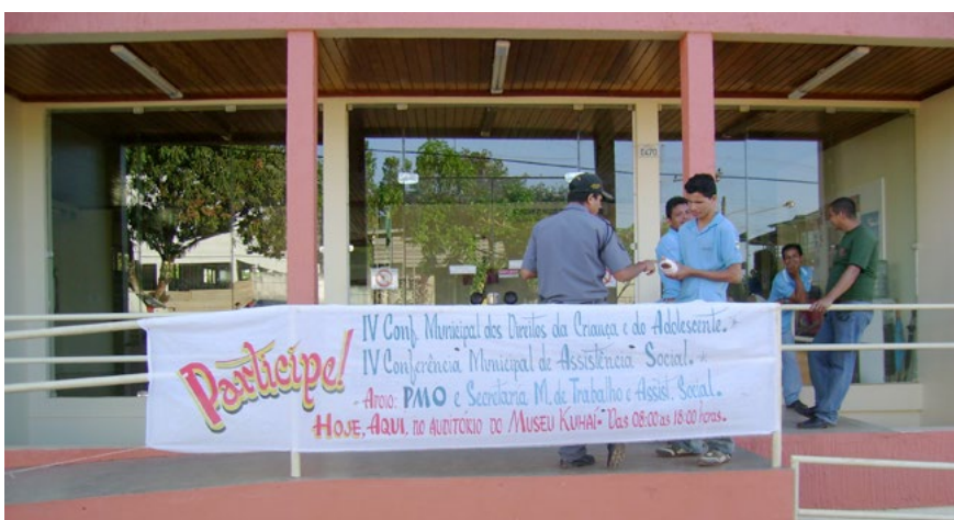
Doc 51. Oiapoque public event held at the Museum.