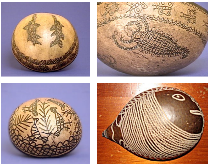
Docs 11, 12, 13, 14: Gourds with figurative and traditional geometric engravings, representing local flora and fauna.