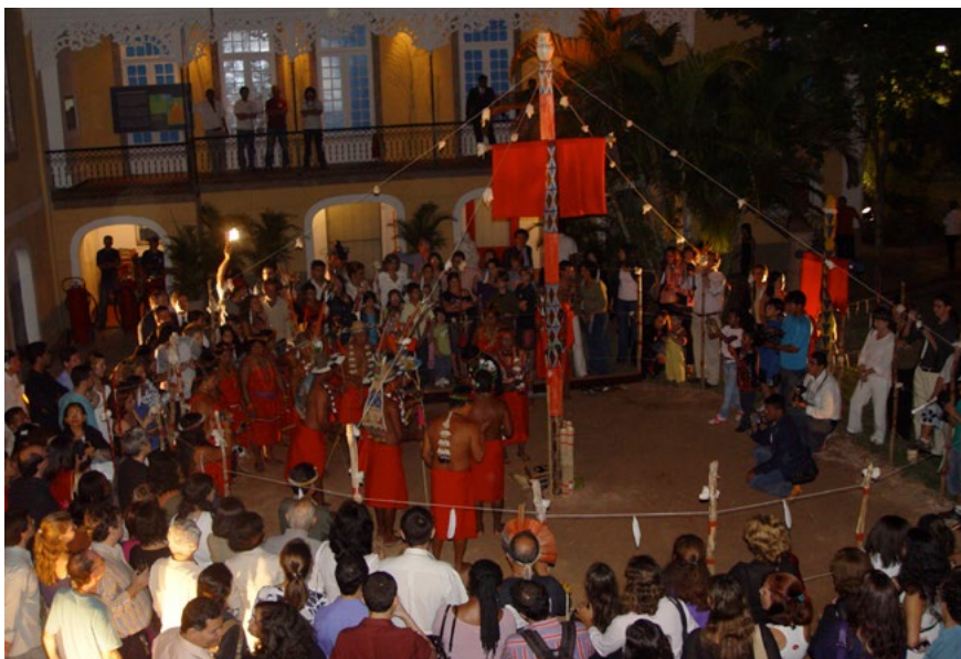
Doc 38: General view of the turé dance.

the basketry and the musical instruments: the cutxi noise horns, the turé clarinets and the maracás . From the domestic environment are sacks of flour, hammocks, football trophies, the banner of the Holy Ghost, and a family altar with their saints, candles and colored ribbons.