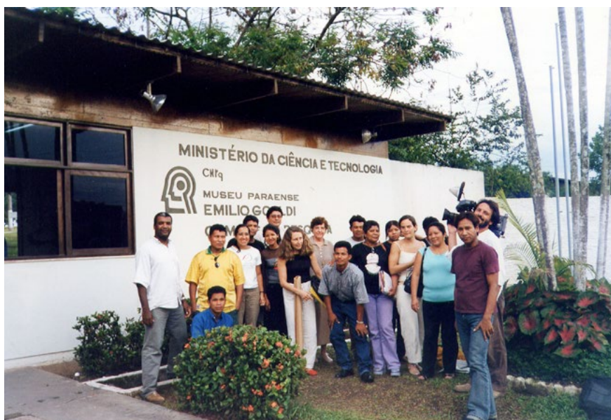
Doc 8: Training workshop at the Museum Goeldi in Belém.