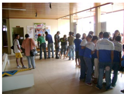
Docs 47 –48: Schools visiting the Museum Kuahí.