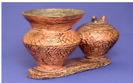
Doc 24.