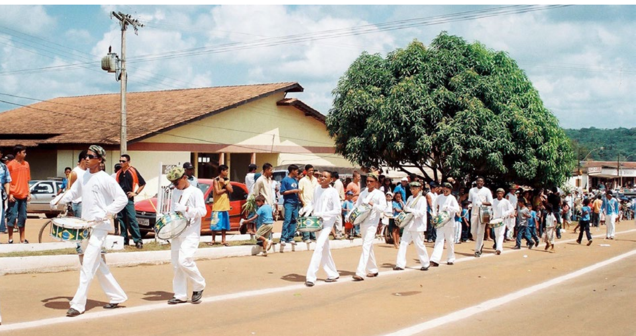
Doc 6. Civic festival in the city of Oiapoque, in front of the Kuahí Museum.

participate, on equal grounds – even if in a differentiated manner – in regional and national life. Aware of their cultural and environmental wealth, of the possibilities for production and ethno-scientific, artisan and artistic promotion; and also aware of the possibilities for sustainable development and the urgent need for better school programs, the indigenous peoples of Oiapoque proposed the Kuahí Museum as a space that would encourage a vast range of activities, research and actions to benefit the indigenous communities and their initiatives as a whole.