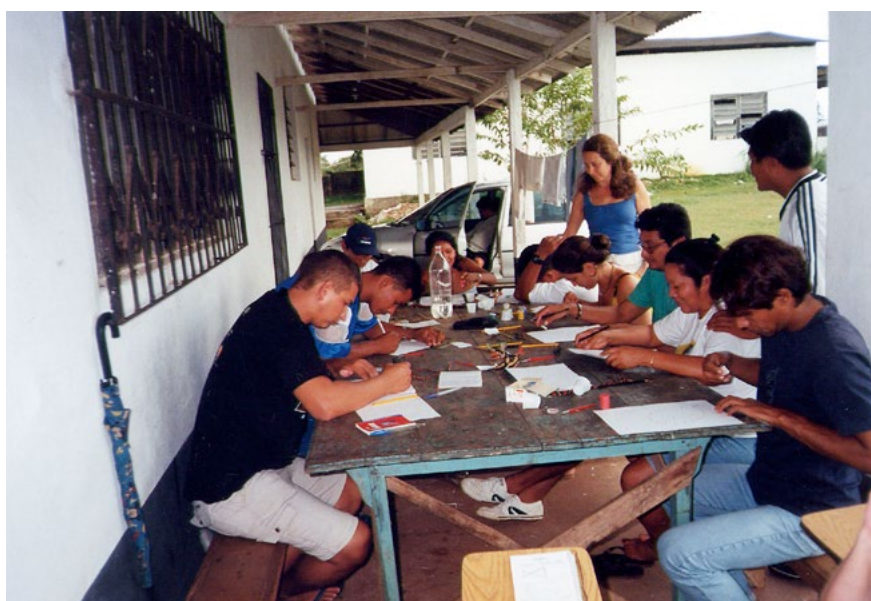
Doc 9: Training workshop in the Parochial House in Oiapoque.