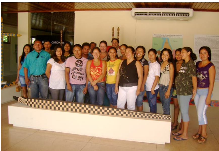
Doc 22: Indigenous staff of the museum and assistants.