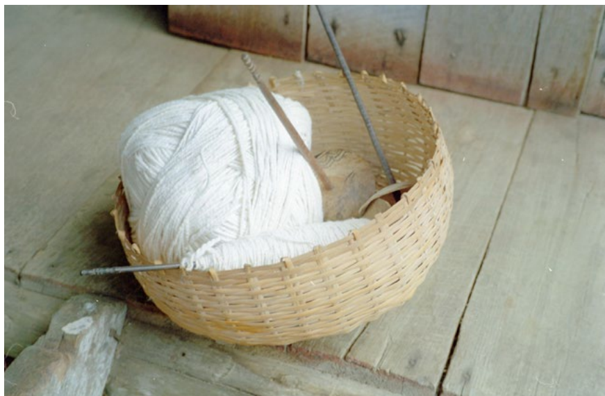
Doc 46: Basket with wad of cotton and spindle for preparing the White hammock.

Another small room was reserved to exhibit only one Galibi Kali’na piece of great value, which was recovered during the project: a white cotton hammock made by two Galibi Kali’na women, one older and another younger, although it is an object that is no longer in use in the village. This single hammock is exhibited in a specific space, accompanied by a basket that has a wad of cotton and the spindle used to prepare the thread.