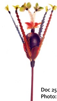
Doc 25.