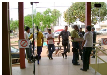
Doc 50. A view of the main street of Oiapoque, from the Museum entrance hall.