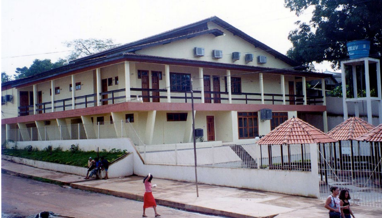
Doc 7 Rear view of the Kuahí Museum.