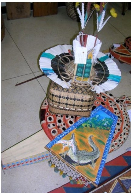
Docs 31 – 34: Collected artifacts for exhibition in Rio de Janeiro, assembled at the Museum Kuahí.