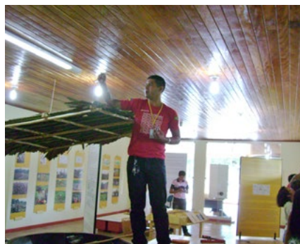
Doc 42 – 43: Preparing the exhibit on manioc fields and cassava flour production.

organizing the data, editing and entering the texts, and for producing designs and photo albums. This research was published in the book, “A Roça e o Kahbe – Produção e comercialização da farinha de mandioca” (Iepé: 2011) “The Planted Ground and the Flour House – Production and Sale of Cassava Flour” and was conceived for use in indigenous schools.