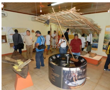
Doc 44 – 45: – Visitors from Brazil, French Guyana, Surinam and Guyana at the inauguration of the exhibit on manioc fields and cassava.

activities, small workgroups were formed among the museum employees (who themselves are farmers in their communities, when they are on vacation) and the participants from the villages, who are fulltime farmers and recognizably better informed about the practices involved in the production of a variety of agricultural products. The information provided by these farmers caused admiration and respect. On the other hand, the museum employees, who are younger, better trained for research and the museographic activities such as registration and documentation, helped the indigenous people from the villages to record their talks by transcribing and translating narratives and myths, and typing and organizing the data, which pleased the people of the village, given that in most cases they were “relatives.” Everyone felt inspired and “at home” at the Kuahí Museum.