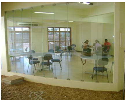
Doc 20: Reading room.

The museum's inauguration, with a significant inaugural exhibit that occupied all of the spaces, would not have been possible without agreement 158/2005 between Secult/AP and the Ministry of Culture – MinC. This agreement allowed Secult/AP to furnish and equip the various installations. The museum now has exhibition rooms, proper storage space, an auditorium that is equipped and suitable for its public, a document processing room, a library, reading room, research room and pedagogy room. At the entrance, a large hall welcomes visitors and also includes a shop that sells crafts. There are also outdoor spaces such as a large veranda, which is used quite often. Thus, the museum has established an exhibit of indigenous crafts available to all the indigenous peoples and residents of Oiapoque, a collection that is quite representative and that is growing through new contributions. The books and magazines from the library have been increasingly requested by indigenous teachers and students to help them in courses. Indigenous teachers from other ethnicities in the region such as the Wayãpi and the Wayana, who are students at the Federal University at Amapá and who are taking courses offered in the city of Oiapoque, also use the library, and leave artifacts for sale in the museum store.