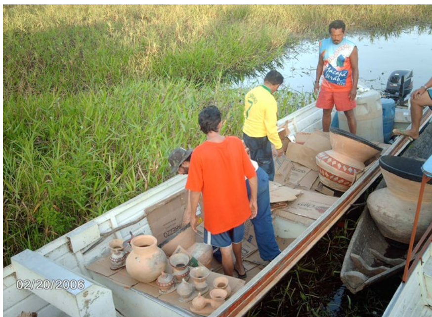
Doc 29: Collecting objects in the villages.