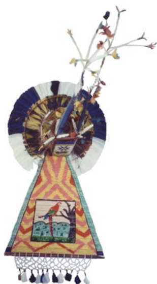
Doc 26 – 27: Feather hat used by men during the turé ritual with geometrical and figurative scenes.