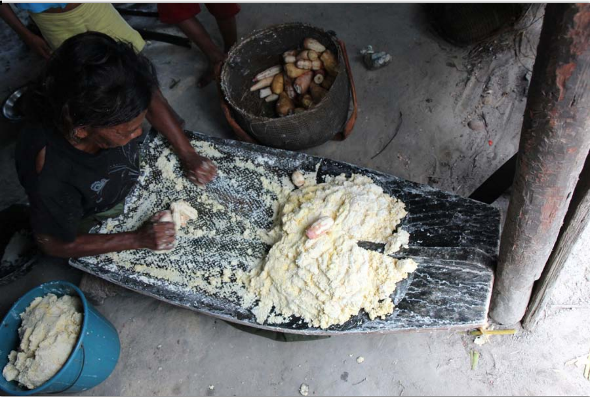
Manioc may be grated in different ways