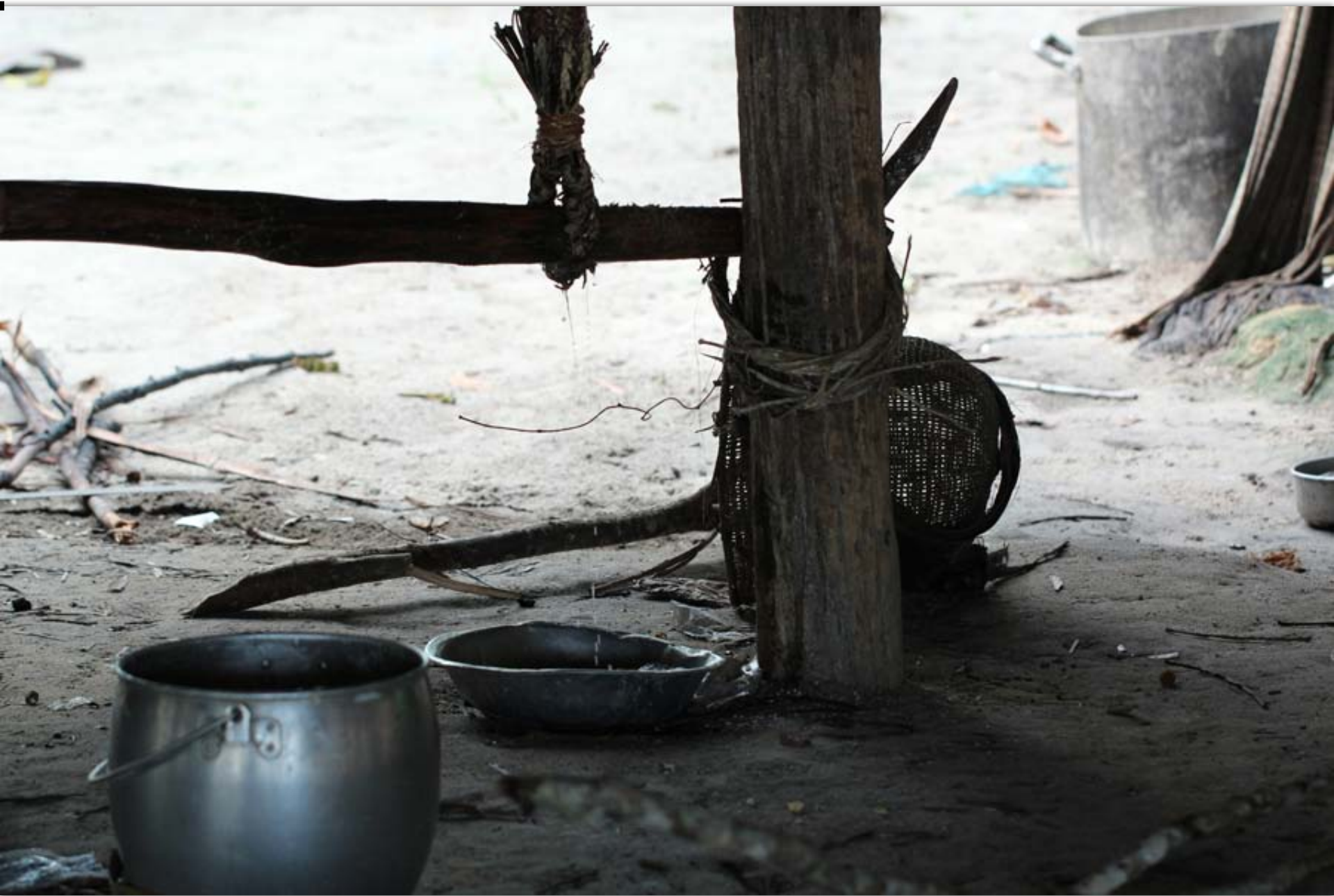
The manioc poison drips into a basin