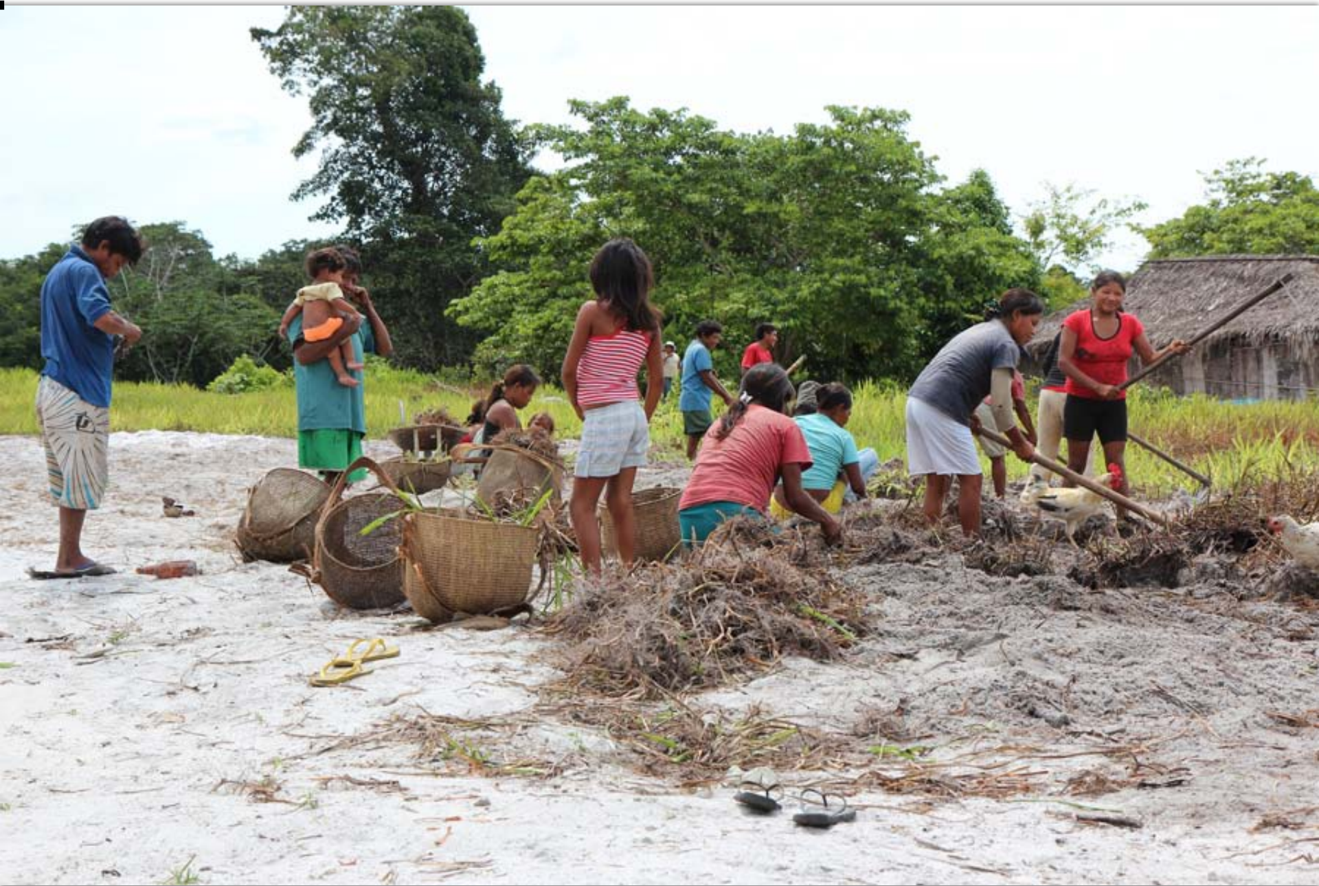
Families gather to clear the grass in front of their houses