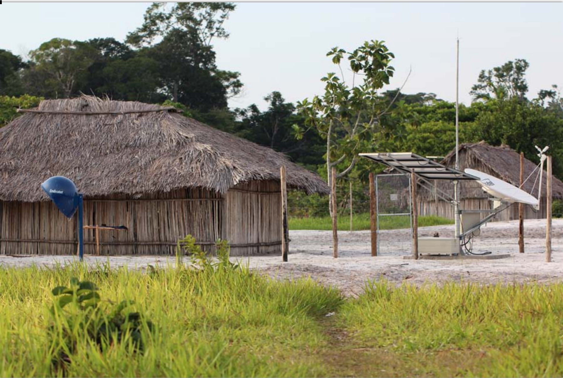
Public telephone in the village