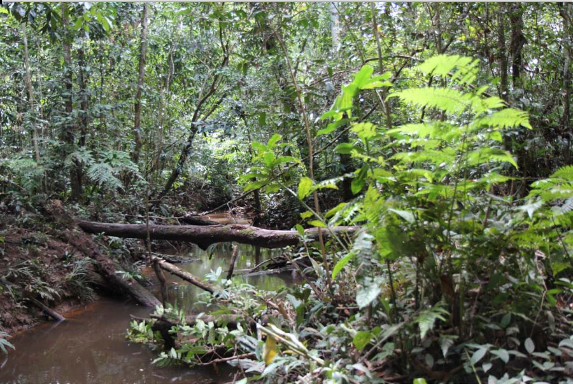
To reach the garden one must cross some bridges like this