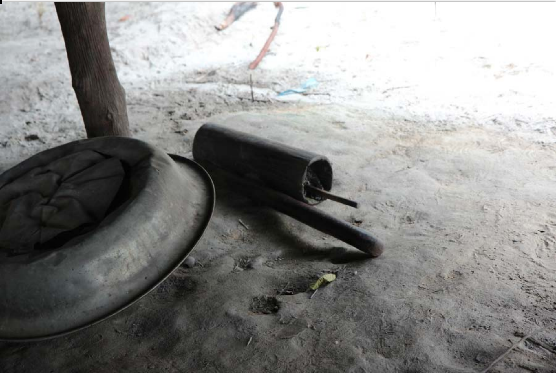
Wooden mortar to soak coca leaves