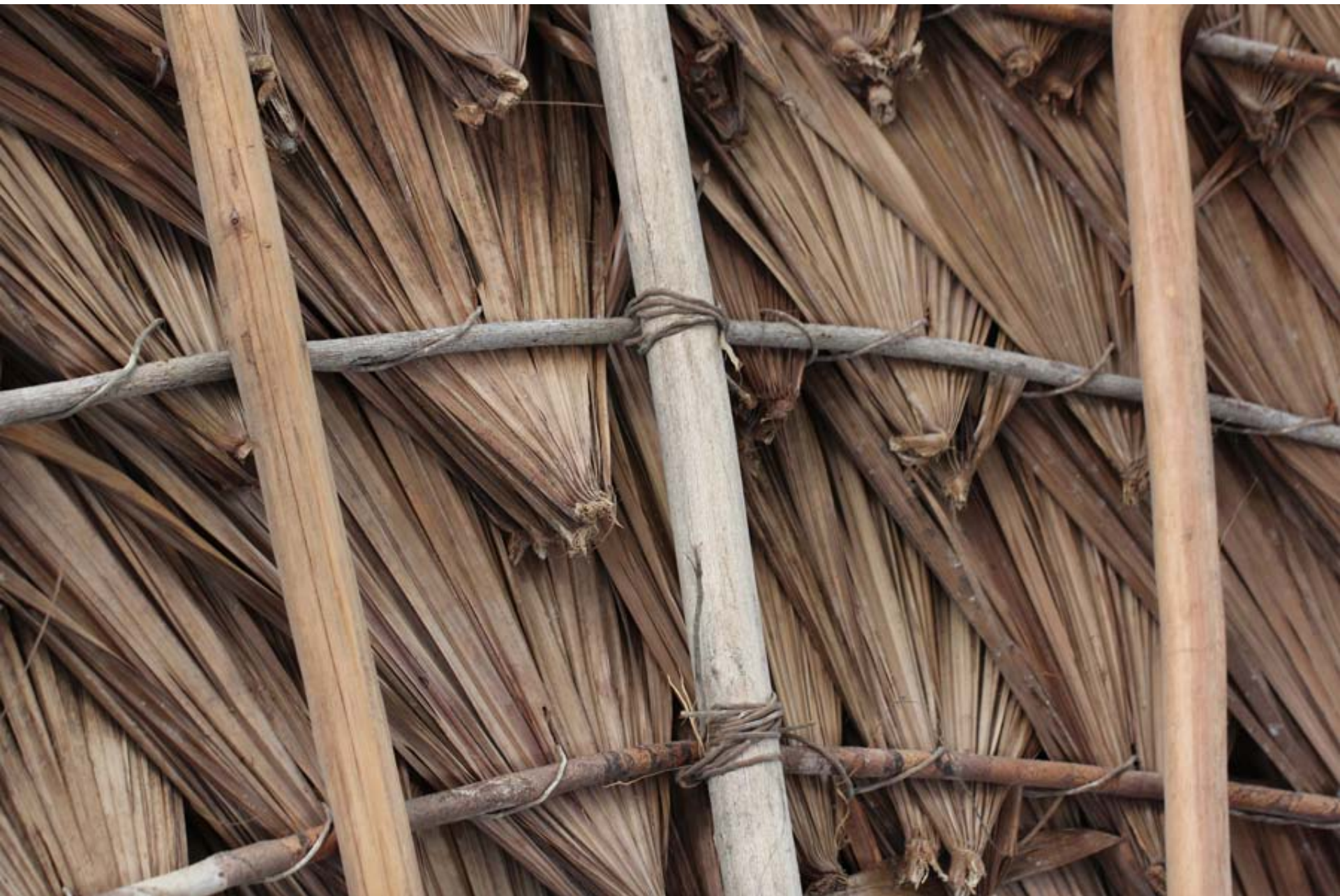
Detail of the covering of the roof, with caranã palm leaves