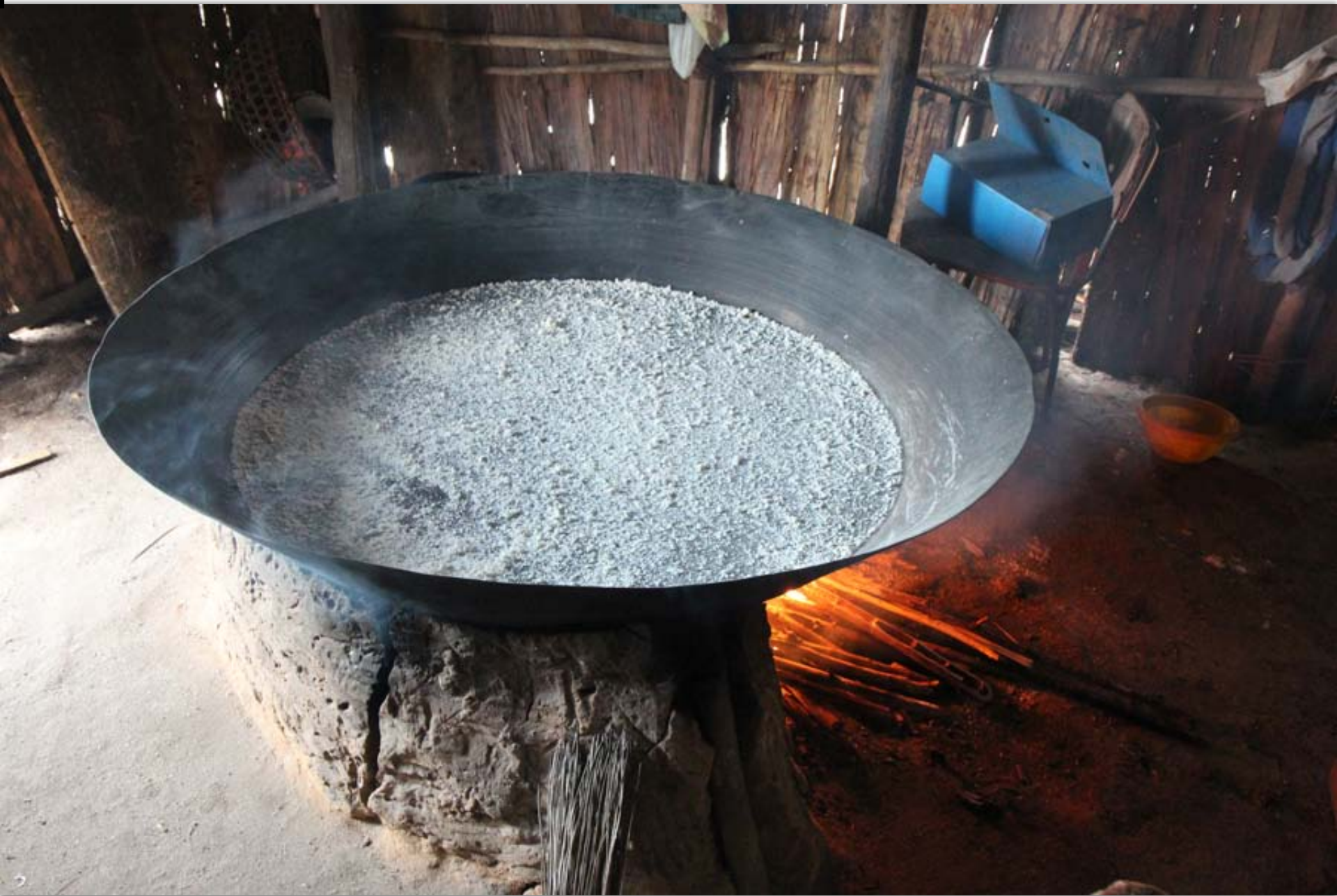
Beiju , the manioc bread