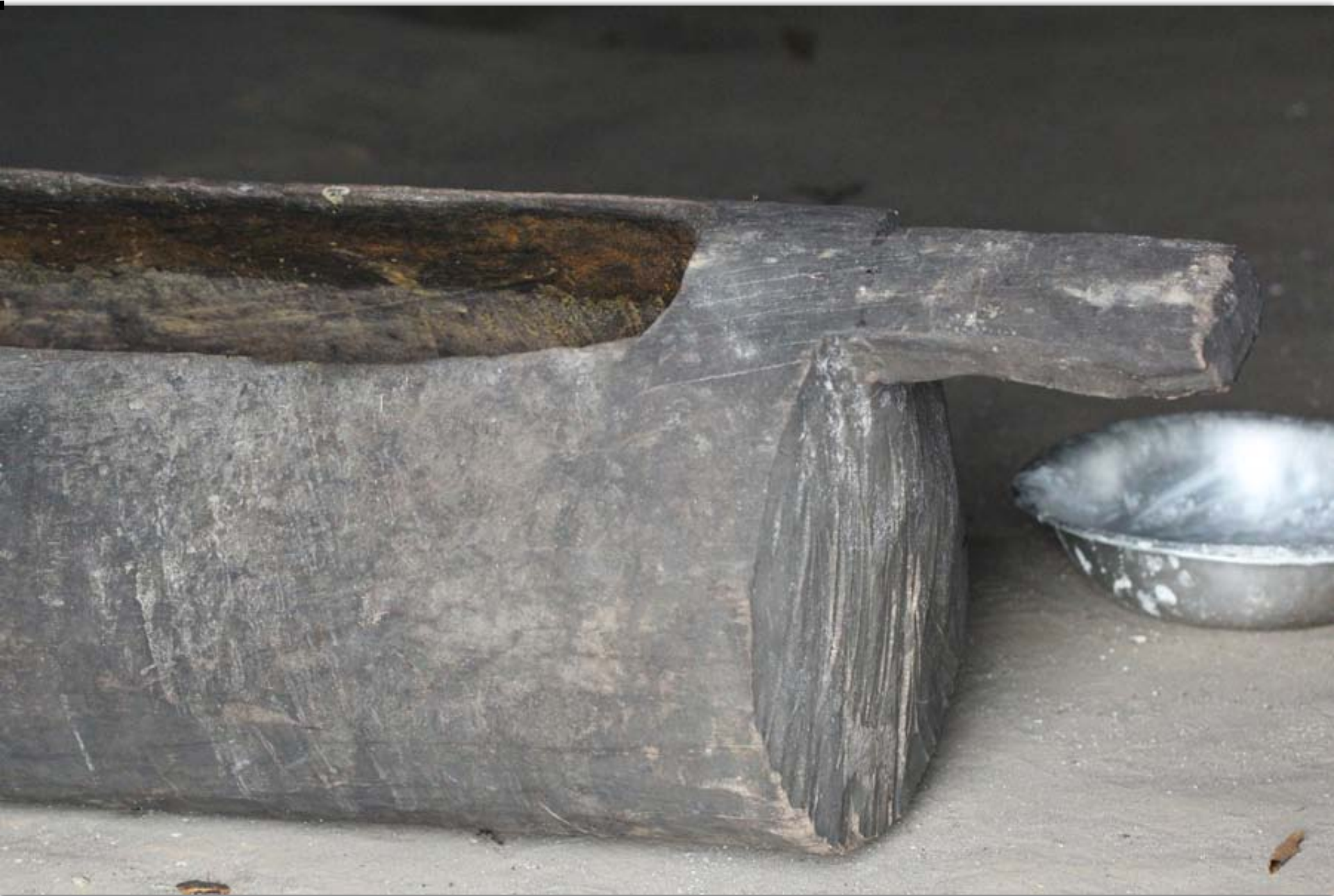
Trough to ferment caxiri