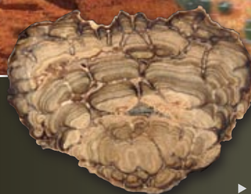
◀ Fossil stromatolite cross section

2 BILLION YEARS AGO: Photosynthetic living organisms have given Earth's atmosphere a small percentage of oxygen, dramatically altering its chemical action. Ferrous (Fe 2+ ) iron minerals common in black basalt are oxidized to rust-red ferric (Fe 3+ ) compounds. This "Great Oxidation Event" paves the way for more than 2,500 new minerals, including rhodonite (found in manganese mines) and turquoise. Microorganisms ( green ) lay down sheets of material called stromatolites, made of minerals such as calcium carbonate.