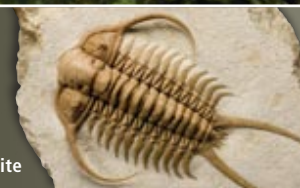
▶ Fossil trilobite

pounds. From space, Earth's continents two billion years ago might have looked something like Mars, albeit with blue oceans and white clouds providing dramatically colorful contrasts.