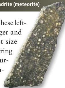
▶ Chondrite (meteorite)