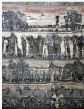
▲ Cap carbonate

Life’s earliest manifestations—primitive single-celled organisms that “fed” on the chemical energy of rocks—cannot have had much effect on Earth’s mineralogical diversity. To be sure, geologists have found biologically mediated rock formations dating back to 3.5 billion years ago, including reefs made of calcium carbonate and so-called banded iron formations (in which iron oxides apparently lock away the first oxygen produced by life). But the land was still barren, the atmosphere at large still lacked oxygen, surface weathering was slow, and the earliest life contributed almost nothing to alter the number of minerals present or their distribution.