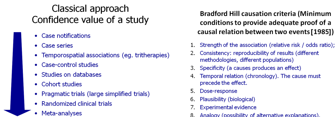
Fig. 1. Comparison between hierarchies of studies according to their confidence value (level of evidence) for example as defined by Bradford Hill causation criteria [5] and Haute autorité de santé . [6]