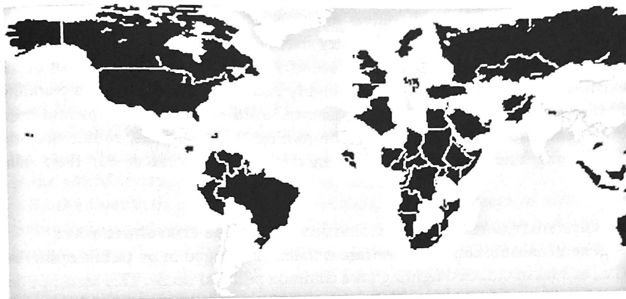
Figure 1. The Global Activity of the Privatized Military Industry, 1991–2001.

NOTE: Areas of PMI activity appear in bold.