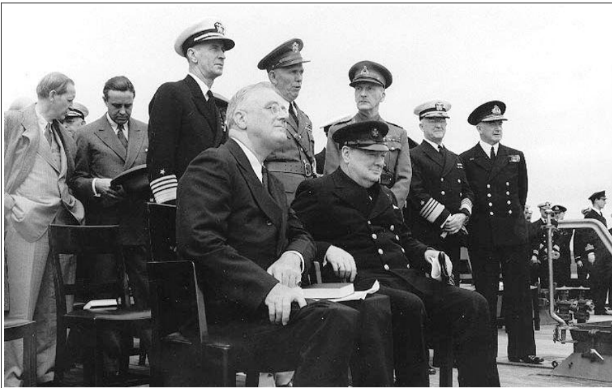
Roosevelt and Churchill aboard HMS Prince of Wales.

. . . There are still a good many people deeply concerned with problems of international security who think exclusively in terms of political arrangements and economic mechanisms such as tariffs and currencies. We would call that the passive approach. The arrangements and mechanisms which they favor are important, and appropriate means must be found to give them effect. But many economists are coming to think that action along these traditional lines would by itself be wholly inadequate. It is increasingly understood that the essential foundation upon which the international security of the future must be built is an economic order so managed and controlled that it will be capable of sustaining full