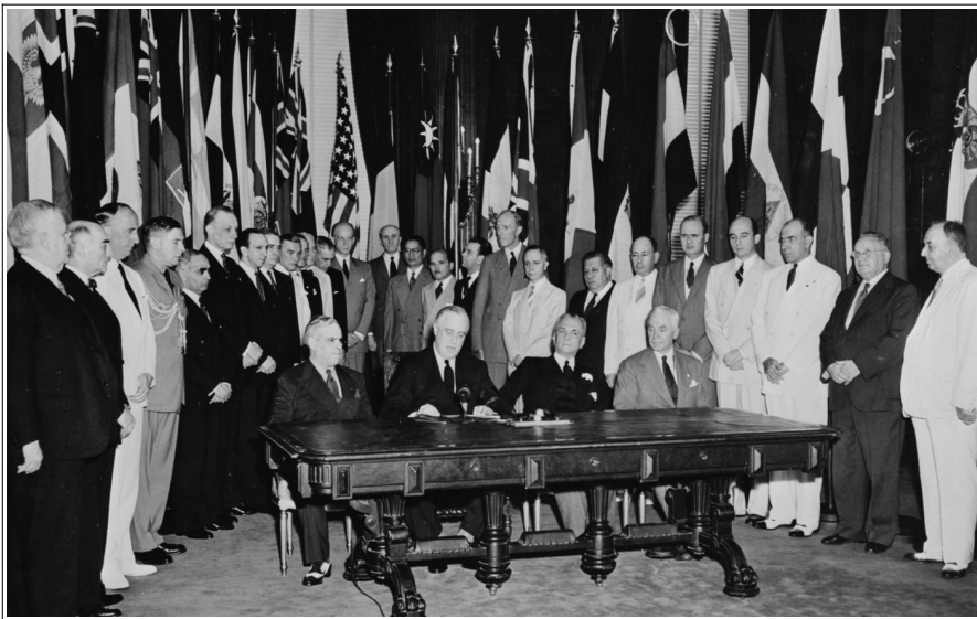
Representatives of 26 United Nations attend Flag Day ceremonies in the White House in 1942.

THE trustful acceptance of false solutions for our perplexing problems adds a touch of pathos to the tragedy of our age.