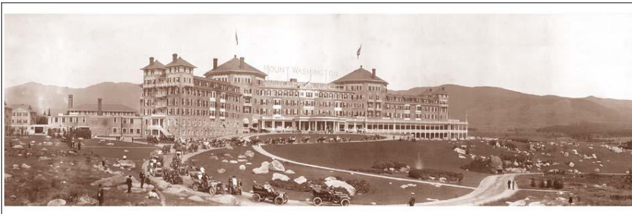
Mount Washington Hotel, Bretton Woods, 1905.

THE United Nations won a great if unheralded victory at the Bretton Woods Monetary and Financial Conference. For they took the first, the most vital and the most difficult step toward putting into effect the sort of international economic program which will be necessary for preserving the peace and creating favorable conditions for world prosperity.