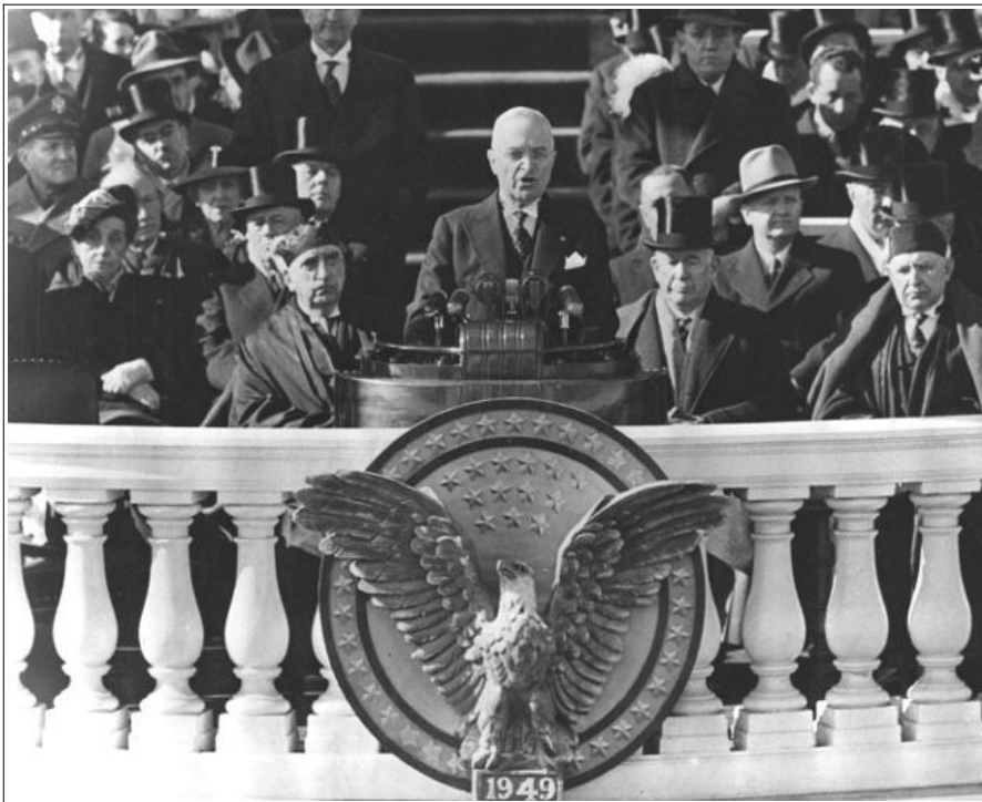
Truman's inaugural address, 1949.

IN A few paragraphs, the fourth point of President Truman's inaugural address in January 1949 phrased a concept that sparked an electric response along the great circuit that links the minds and imaginations of human beings throughout the world. The concept was basically simple. It declared that: