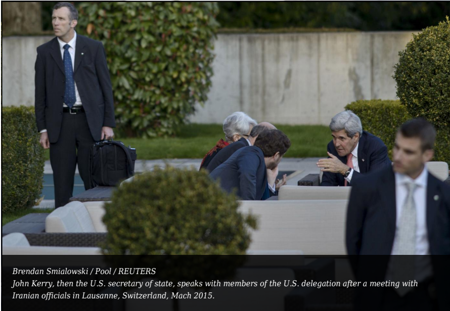
John Kerry, then the U.S. secretary of state, speaks with members of the U.S. delegation after a meeting with Iranian officials in Lausanne, Switzerland, March 2015.