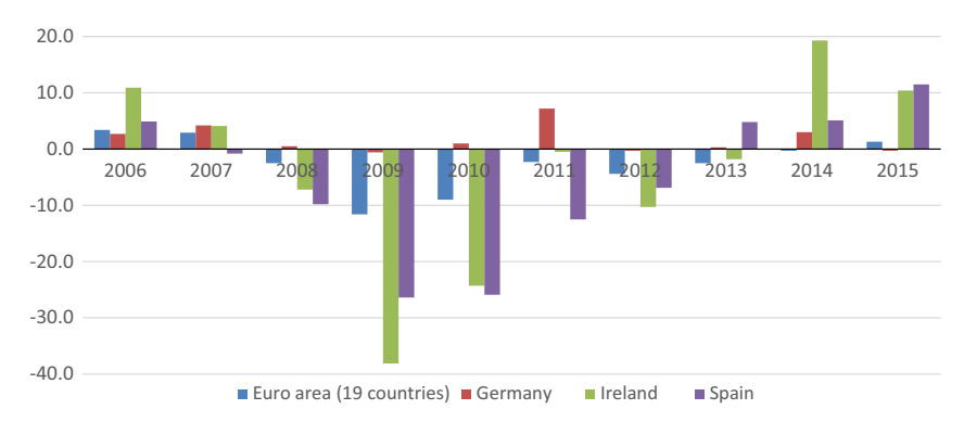
Figure 3. Construction industry, selected countries, volume of work done (hours worked): percentage change compared to same period in previous year