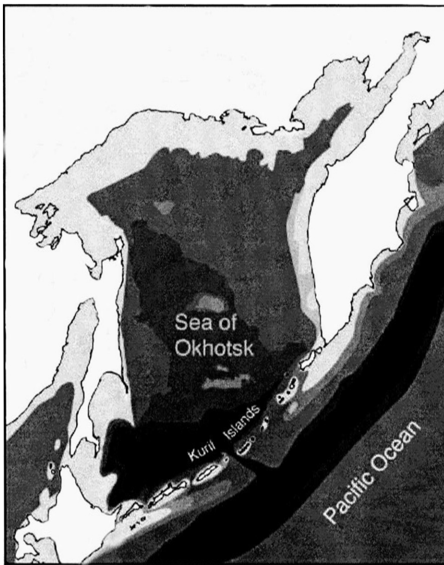
Fig. 3. Geography of the Kuril Islands and Sea of Okhotsk area during the Last Glacial Maximum (adapted from Pietsch et al., 2003).

oceanic islands—but kelp forests were luxuriant and sea otters, multiple pinniped and cetacean species, marine and anadromous fish (salmonids, halibut, etc.), seabirds and waterfowl, shellfish and seaweeds were all available to varying degrees across the archipelago (see Snow, 1897). Fitzhugh et al. (2004:95) suggested that various parts of the Kuril chain may not have been occupied continuously by humans for more than ~2500–4200 years. Relatively little archaeology has been done in the islands (e.g., Baba, 1934; Zaitseva et al., 1993; Fitzhugh et al., 2002), but recent efforts by Fitzhugh et al. (2004, 2007) and others (e.g., Yanshina et al., 2009; Vasilevski et al., 2010) have begun to flesh out a basic chronology and culture history of the islands from the Middle Holocene on. The Late Pleistocene and Early Holocene paleogeography, paleoecology, and archaeology of the archipelago are poorly known, however, and the oldest well-dated sites on the Kurils are only ~7500–8000 years old. Recent research at the Yankito I and II sites on Iturup found Early Jomon pottery and stone tools associated with charcoal samples AMS ^{14}\text{C} dated between ~8000 and 7600 cal BP (Yanshina et al., 2009). Fitzhugh et al. (2007:166) also described a microblade-bearing component at the undated and