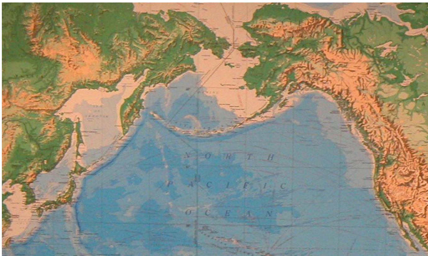
Fig. 1. The geography of the North Pacific region, showing island arcs, continental shelves, and the now submerged central Beringia region (adapted from Environmental Graphics (1992), scale = 1:10,100,000).

migrate northward through the Kuril Islands, to Kamchatka and the southern shores of Beringia. Simultaneously, climatic amelioration and the warming of northeast Pacific waters early in the deglacial (Sarnthein et al., 2006) may have 'pulled' maritime peoples northward towards Beringia. Alternatively, but seemingly less likely, cold-adapted coastal peoples capable of living and hunting in seasonal sea ice conditions of the North Pacific may have migrated towards Beringia's south coast during the LGM.