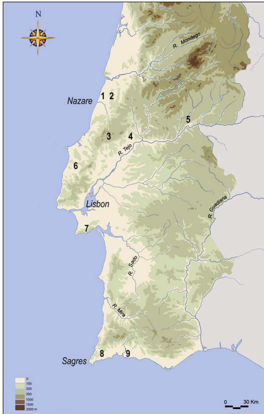
Fig. 1. Map with sites referred to in the text. 1. Mira Nascente; 2. Lapedo (Lagar Velho); 3. Picareiro and Coelhos Cave; 4. Caldeirão Cave; 5. Foz do Enxarrique; 6. Suão Cave; 7. Figueira Brava Cave; 8. Vale Boi; and 9. Ibn Ammar Cave.

hunting at Picareiro Cave suggested specialized hunting of certain animal species (Bicho, 1993). The existence of sites with shell middens containing shellfish, marine and estuarine fish and crustaceans evidenced dietary diversification (Bicho, 1998). Both aspects were present just prior to the onset of the Holocene. Bicho (1994) concluded that there was a demographic expansion of human population that occurred in two phases: one around 10,000 years ago, and a second pulse 2500 years later with the appearance of the Mesolithic populations of the Tagus (in the Muge) and Sado Basins (Bicho, 1994).