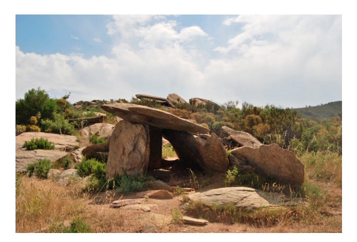
Fig. 1. Dolmen de las Ruines, Catalonia.

megalithic sequence as precisely as possible, we adopted a Bayesian modeling approach, which is applied here to a wide region, using the program OxCal 4.1 (11, 12). We combined measurements with archaeological information relating to stratigraphical contexts, associated cultural material, and information on the burial rites, to narrow the time intervals for the calibrated ranges. In a first important step, we reviewed critically the 2,410 samples, including measurements from the 1960s up to the present, to determine the quality and reliability of the sample contexts. For each site with available radiocarbon results and a suitable sequence, we constructed one-phased or multiphased models with phase boundaries (Datasets S2 and S3) taking into consideration the detailed stratigraphic information (13). The posterior density estimates expressed as probability distributions in the text and in the figures are given by convention in italics to distinguish them clearly from simple calibrated radiocarbon dates.