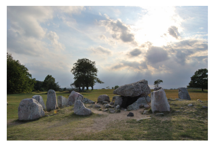
Fig. 2. Haväng dolmen, Scania. Strikingly, the architectonic concepts of megaliths are similar or even identical all over Europe.

In the northern half of the western Iberian Peninsula, there are early megaliths, concentrated mainly in Galicia. So far, these