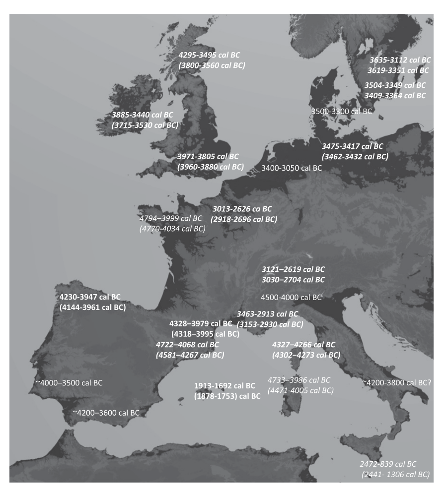
Fig. 3. Map showing dates estimated for the start of megaliths in the different European regions, with 95% probability (68% probability in brackets). Italic bold type is used for date ranges of the posterior density estimates based on samples from megalithic contexts, regular bold type is used for simple calibrated radiocarbon dates from megalithic contexts, and regular italic type is used for the probabilities of the posterior density estimates associated with the earliest cultural material in the megaliths.

have been dated to the very end of the fifth millennium cal BC, if not later. Most of these dates are from charcoal, and many represent termini post quos values due to the inbuilt age of the wood or unsure contexts. From Chan de Cruz 1, a possible construction or usage date from ~4080 cal BC (CSIC-642, 5210 \pm 50 BP, 4144 cal BC to 3961 cal BC, 68.2%; 4230 cal BC to 3947 cal BC, 95.4%) (Dataset S1, 2014) is available.