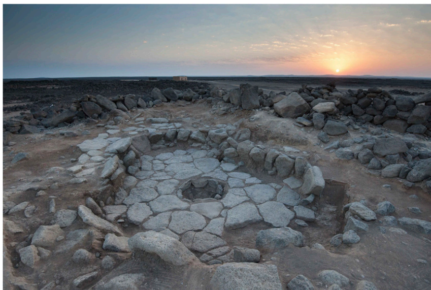
Fig. 2. The site of Shubayqa 1 showing Structure 1 and one of the fireplaces (the oldest one) where the bread-like remains were discovered.

At Shubayqa 1, a total of 24 food remains were categorized as bread-like products based on the estimation, quantification, measurement, and typological classification of plant particles and voids visible in the food matrix ( Materials and Methods ). From these, 22 were found in the oldest fireplace and 2 in the youngest. Macroscopically, all fragments showed a starchy, often vitrified, microstructure and irregular porous matrix, indicative of well-processed food components (Fig. 3A and SI Appendix, Figs. S1 and S8 ). The average size of the remains was between 4.4 mm width, 2.5 mm height, and 5.7 mm length ( SI Appendix, Table S1 ). The basic classification system based on height measurements suggests that they probably represent unleavened flat bread-like products, as their height was <25 mm (13). This idea is supported by the size of the voids. In modern leavened breads, voids are >1 mm in size and commonly cover 40–70% of the matrix (14). The size of the voids of the bread-like remains from Shubayqa 1 was 0.15 mm on average and they were present in 16% of the matrix ( SI Appendix, Table S2 ). These results are in agreement with finds identified as “flat breads” from several Neolithic and Roman age sites in Europe and Turkey (2, 11, 12).