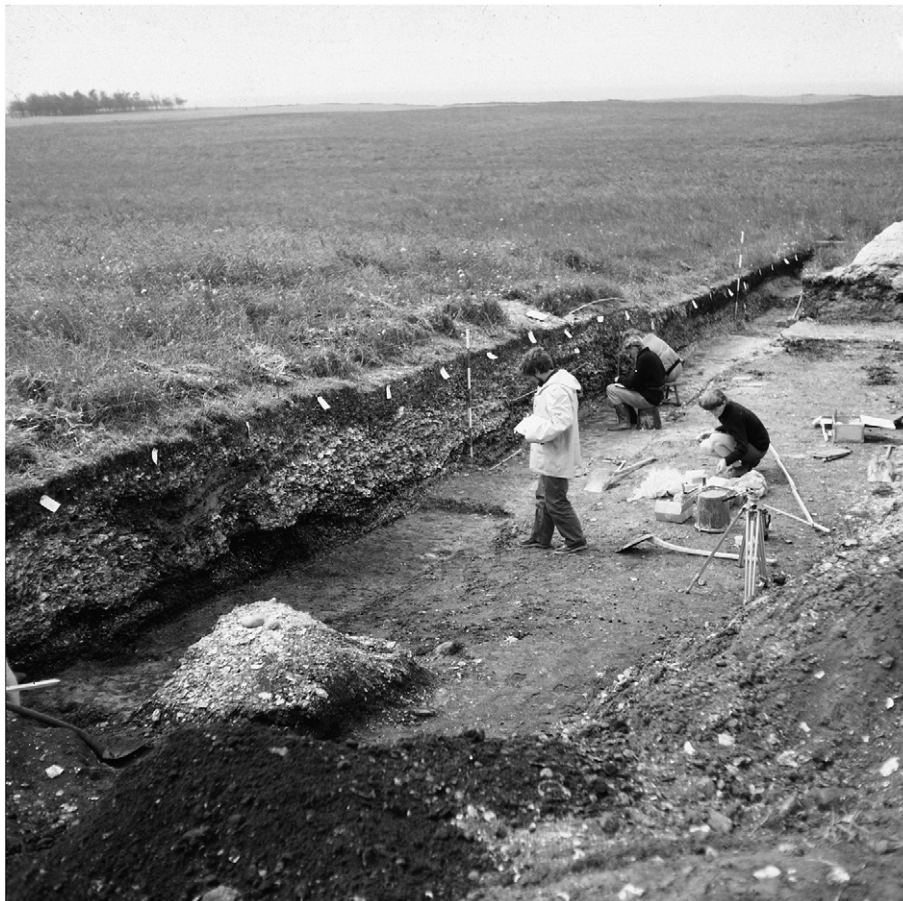
Fig. 2. Excavations at the shell midden of Ertebølle (Denmark) in 1980. The picture shows how the midden is built up by several, individual and smaller shell deposits – dominated by oysters. Here the shell midden is ca. 25 m wide and 1.20 m thick and stretches along the Late Mesolithic coastline.

A Danish shell midden ( Køkkenmødding ) is defined as a special type of coastal settlement with a cultural deposit in which at least ca. 50% of the volume consists of marine shells, and the cultural layer forms a continuous horizon exceeding more than 10 m 2 ; if this is not the case the site is called “a shell-bearing site” (Andersen, 2000) (Fig. 2). Denmark is the northern European region with the highest number of Køkkenmøddinger of which ca. 500–550 sites have been recorded. Additionally, there are also a number of