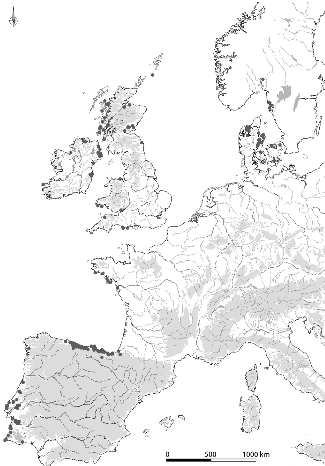
Fig. 1. Distribution of Mesolithic shell middens and shell-bearing sites along Atlantic Europe (Map: C. Dupont).

the available information from the Middle Palaeolithic to the start of the Neolithic still needs to be brought together, in order to compare the situation of the research in different regions of Atlantic Europe. This paper reviews the available information regarding the characteristics of the sites and their chronology, the composition of the shell middens, the settlement patterns and the