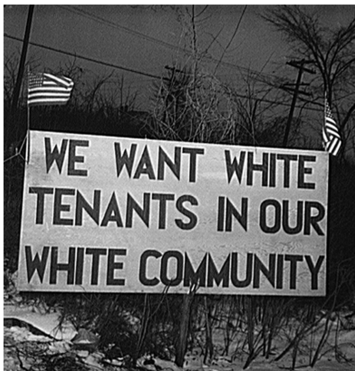
Figure 2. Opposition to blacks who attempted to move into Detroit's suburbs in the 1950s and 60s had a recent and bloody history. In 1942, hostile white Detroiters placed this sign opposite the Sojourner Truth housing project in the city to prevent black tenants from moving into the building. These tensions helped fuel the deadly Detroit riots of 1943, and undermined the claims of a "colorblind" Detroit that allegedly greeted Rosa Parks when she arrived only fourteen years later.

So when the Parks family moved to Detroit in August 1957 they found racism "almost as widespread as Montgomery" (8). Arriving in