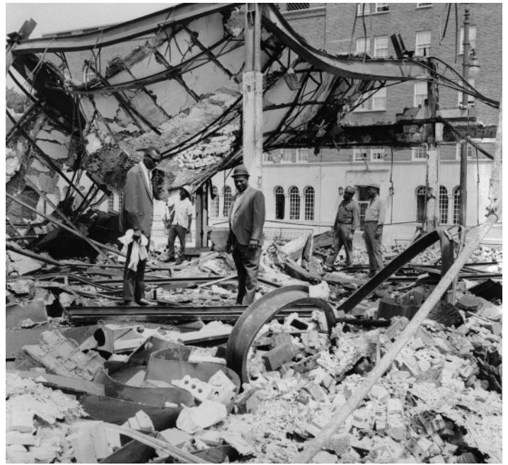
Figure 4. Civil rights and labor activist William Lucy (left) of the American Federation of State, County and Municipal Employees surveys the destruction caused by the 1967 Detroit riots. According to Rosa Parks, black discontent over the social inequities endemic in the city and white resistance to change triggered the uprising. In its aftermath, Parks helped form the Virginia Park district council which promoted a projects to rebuild the area, including the construction of the only black-owned shopping center in the country.

Perhaps the most egregious event came when police killed three young men in the Algiers Motel. While the officers claimed a gun battle