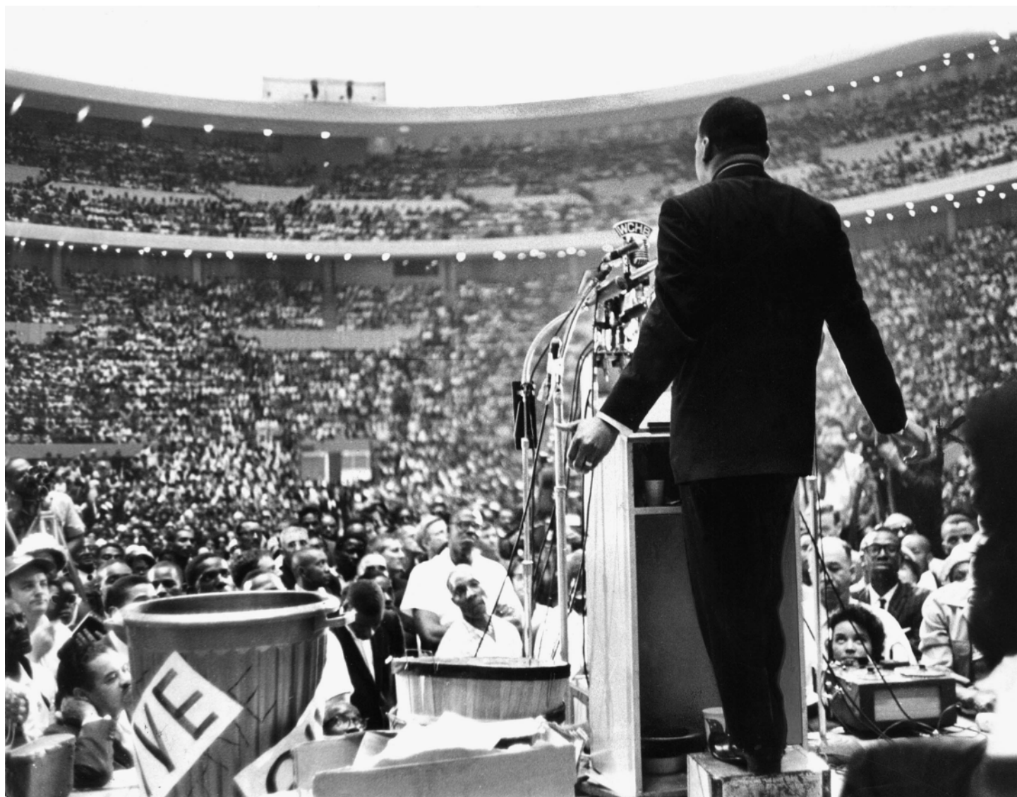
Figure 3. Two months before the March on Washington, Martin Luther King, Jr. delivers his original “I Have a Dream” speech in front of a crowd of nearly two hundred thousand Detroiters, assembled for the city’s Great March to Freedom on June 23, 1963. In Alabama, Parks had joined King in the fight to desegregate public transit, while in Detroit, the two combined forces for a similarly pressing issue, the fight for open housing. Contrary to myth, both Parks and King were widely reviled and red-baited by whites, who sent hate mail to both activists.

employment; “I went to a lot of meetings” Parks noted, “and sometimes when they would take up contributions, but that was never high” (18). So for nearly a decade, the family struggled. Raymond worked as a barber. Rosa took in piecework, and then got a job sewing aprons and skirts ten hours a day at the Stockton Sewing Company. Paid seventy-five cents per piece, it was arduous, exhausting work.