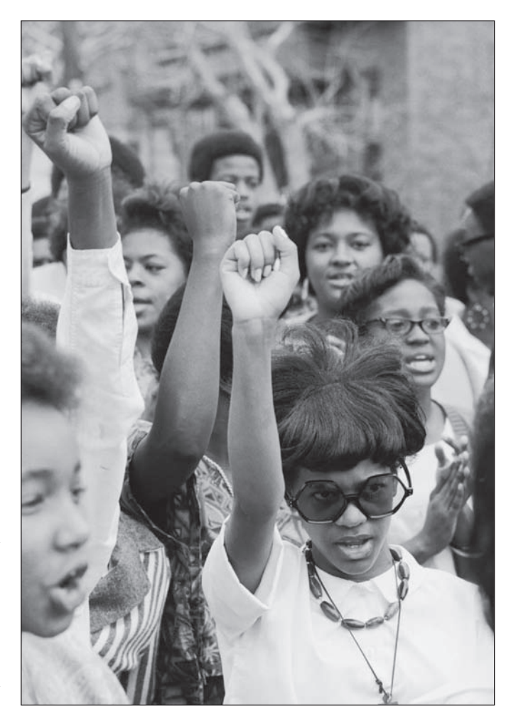
Young women raise their fists in the Black Power salute at a civil rights rally, ca. 1960s.

Such spellbinding masculine images of Black Power dominated not only public attention in the late 1960s and 1970s, but also the history recalled, told, and written about the era-despite black women's presence in the visual record (I). However, as the historiography of the post-World War II black freedom struggle continues to expand, and within it the nascent field of "Black Power Studies," scholars are complicating what has become an obfuscating and incomplete visual and historical narrative of the Black Power era (2). Unfolding at a time in the historical profession when feminist scholars and analyses of race, gender, and class have helped to destabilize and complicate malecentered histories, Black Power Studies is simultaneously being shaped and enriched by research attuned to women and gender.