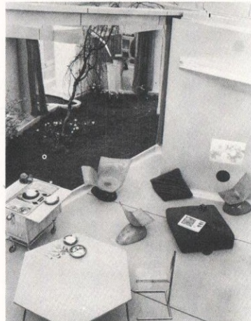
Installation view of House of the Future, 1956, interior.