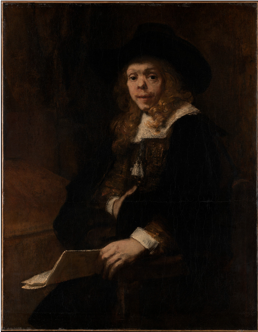
FIG 4 1665 portrait of renowned painter, poet, and public intellectual Gérard de Lairesse (1641 to 1711), by Rembrandt Harmenszoon van Rijn (1606 to 1669). Lairesse's facial deformities caused him to be shunned by some contemporaries; they are now thought to have resulted from congenital syphilis. ( https://www.metmuseum.org/art/collection/search/459082 ; public domain.)

ized almost all pandemics, and now we are experiencing shock at the overwhelming of hospitals and the hastily dug mass graves associated with COVID-19.