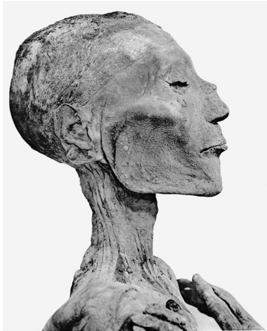
FIG 2 Mummy of Pharaoh Usermaatre Sekheperenre Ramesses V (ca. 1196 to 1145 BCE), showing smallpox lesions, e.g., on the bridge of his nose ( https://en.wikipedia.org/wiki/Ramesses_V#/media/File:Ramses_V_mummy_head.png ).

425 BCE) was perhaps the first recorded pandemic: it spread over much of the world known to the Greeks, including the Mediterranean and northern Africa (8). Although the cause of the Athenian plague has not been identified (anthrax, bubonic/pneumonic plague, smallpox, and typhus are leading candidates), it was the first disease investigated and described using clinical and epidemiological approaches. It remains today a benchmark for pandemic comparisons.