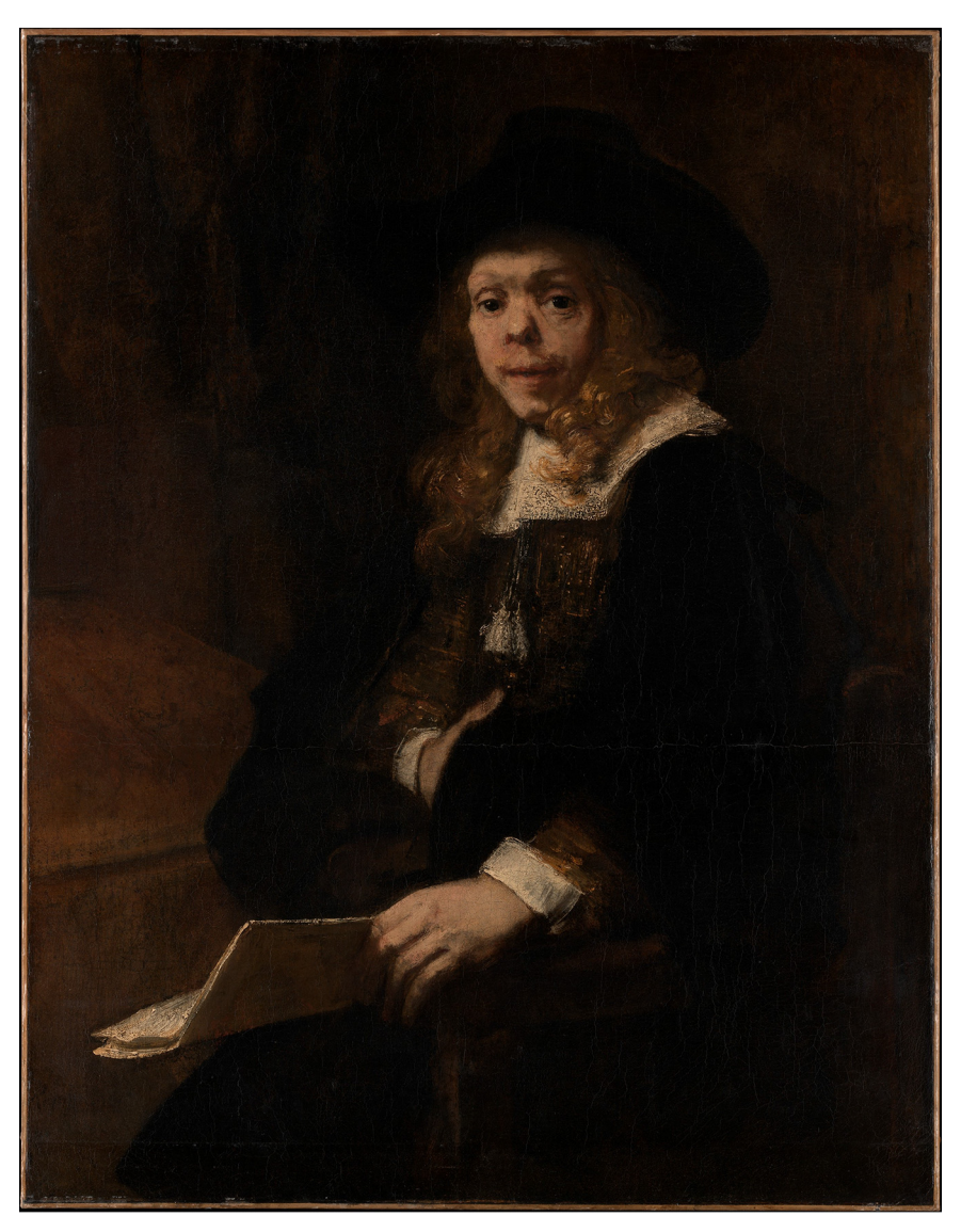
FIG 4 1665 portrait of renowned painter, poet, and public intellectual Gérard de Lairesse (1641 to 1711), by Rembrandt Harmenszoon van Rijn (1606 to 1669). Lairesse's facial deformities caused him to be shunned by some contemporaries; they are now thought to have resulted from congenital syphilis. (https://www.metmuseum.org/art/collection/search/459082; public domain.)

ized almost all pandemics, and now we are experiencing shock at the overwhelming of hospitals and the hastily dug mass graves associated with COVID-19.