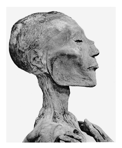
FIG 2 Mummy of Pharaoh Usermaatre Sekheperenre Ramesses V (ca. 1196 to 1145 BCE), showing smallpox lesions, e.g., on the bridge of his nose (https://en.wikipedia.org/wiki/Ramesses_V#/media/ File:Ramses_V_mummy_head.png).

425 BCE) was perhaps the first recorded pandemic: it spread over much of the world known to the Greeks, including the Mediterranean and northern Africa (8). Although the cause of the Athenian plague has not been identified (anthrax, bubonic/pneumonic plague, smallpox, and typhus are leading candidates), it was the first disease investigated and described using clinical and epidemiological approaches. It remains today a benchmark for pandemic comparisons.