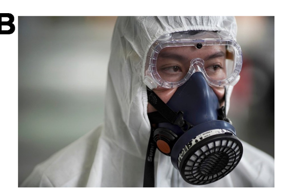
FIG 3 Fighting plagues (A) in the 17th century (https://www.dhm.de/blog/2017/07/27/beaky-plague-protection/) and (B) in 2020 (caused by SARS-CoV-2 [https://www.nst.com.my/world/world/2020/01/560477/only-high-quality-masks-can-defend-against-corona virus,%20image%20used%20by%20permission%20of%20Reuters%20News%20Agency, image used by permission of Reuters News Agency]).