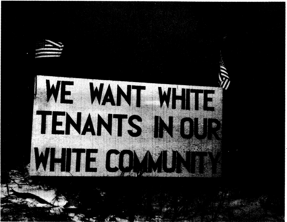
Sign protesting plans to open the Sojourner Truth Homes, a public housing project on Detroit's northeast side, to African Americans, February 1942.