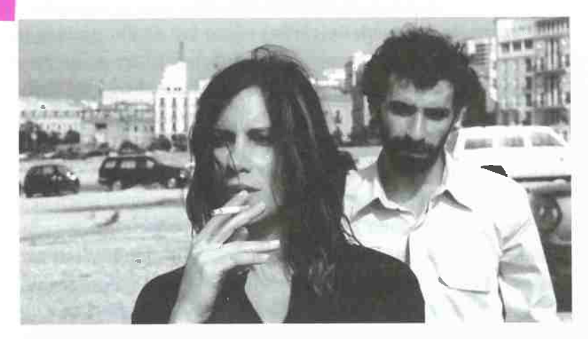
Terra Incognita (al-Ard al-madjhula, 2002) by Ghassan Salhab