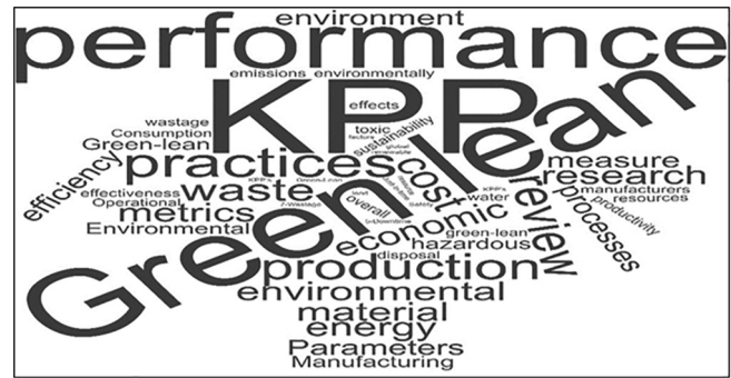
Fig. 1. Word clouds of the words in literature review.

Note-1- Operating Cost, 8- Air emission2- Product Quality, 9- Energy Consumption3- Customer Satisfaction 10- Safety of employees4-Delivery Time, 11- Image in Public5-Downtime, 12- Ingesting of solid wastes6- OEE, 13- Consumption of toxic materials7-Wastage 14- Job satisfaction