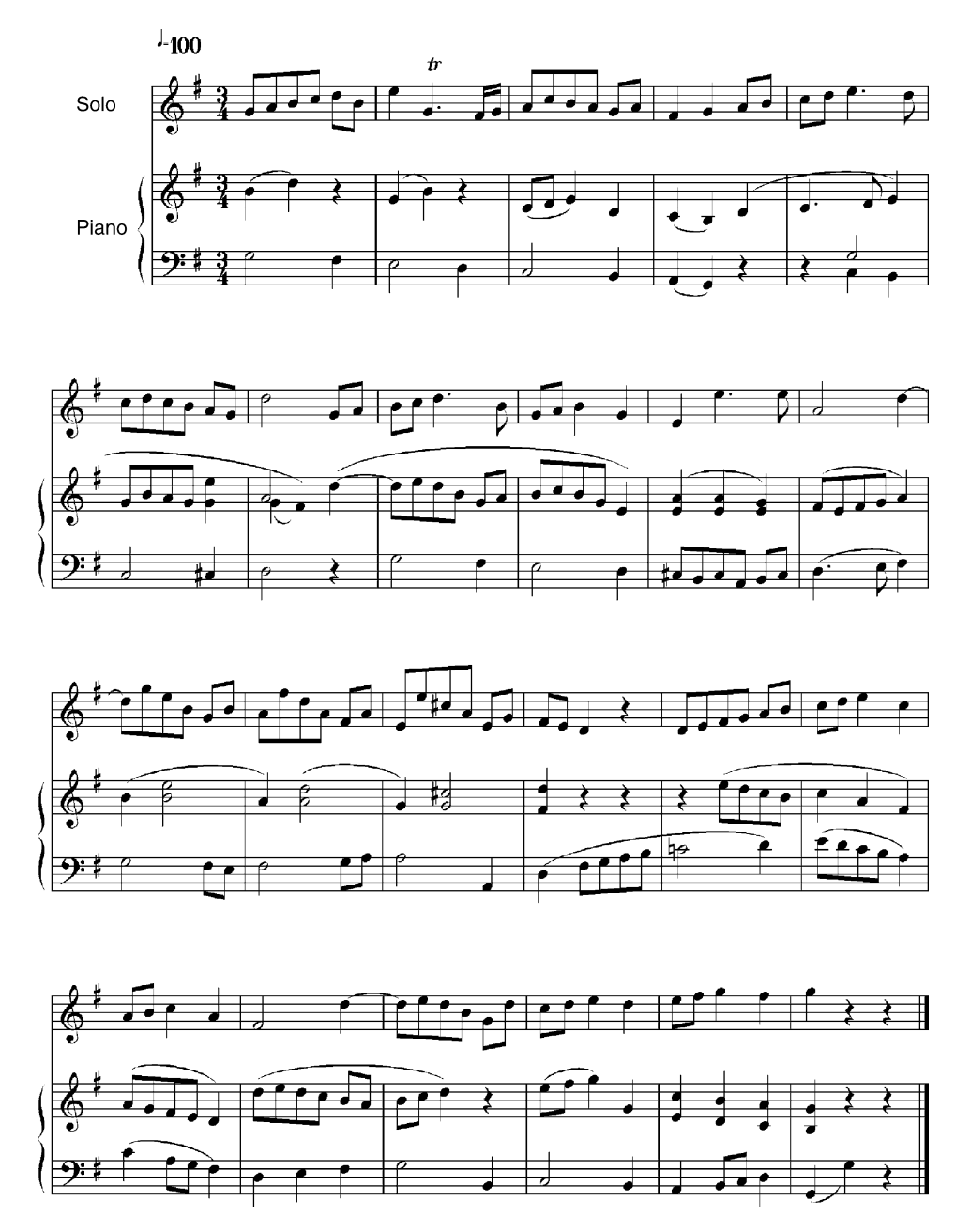
Figure 1. Example for the sight reading task warm-up piece No. 1 anonymous. Piece was re-arranged for solo voice and accompaniment

For the construction of SR tasks, the 'pre-recorded pacing melody paradigm' (Lehmann & Ericsson, 1993, 1996) was used. The solo voice was performed by a violinist who recorded these melodies while synchronizing with a metronome through headphones. Subjects were given 60 seconds to study each piece without