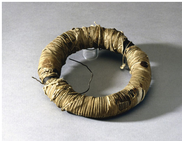
Figure 1. Faraday's induction ring (1831).

Faraday went on to experiment with more powerful permanent magnets and electromagnets of different strengths, but the basic principle was the same. He states triumphantly that 'the various experiments... prove, I think, most completely the production of electricity from ordinary magnetism' ([9], §57). He decides to refer to 'the agency thus exerted by ordinary magnets' as magneto-electric induction to distinguish it from volta-electric induction produced by the field of a current carrying wire. As for the second wire, which is subjected to this induction, he describes it as being 'in a peculiar state' of resisting the formation of an electric current in it and refers to it as being in an electro-tonic state. But at this point he admits that he has yet to understand the properties of matter whilst retained in this state, particularly since he experiments with various different conducting materials, such as copper and silver, which are not themselves magnetic.