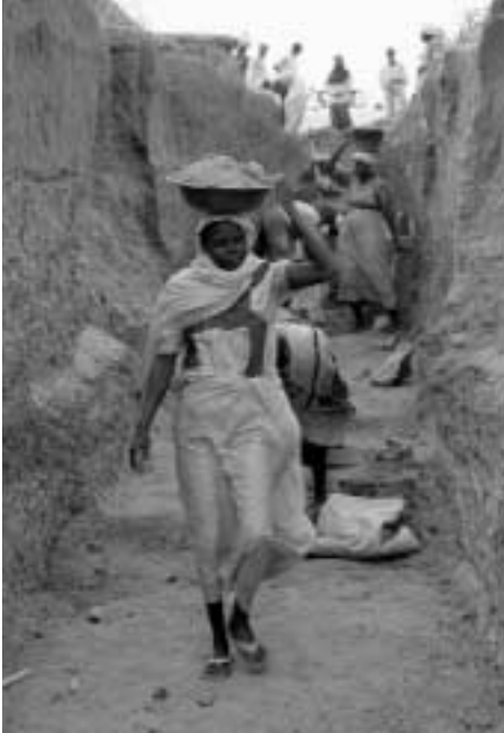
Constructing a traditional hand-dug reservoir ( hafir ) in Sudan