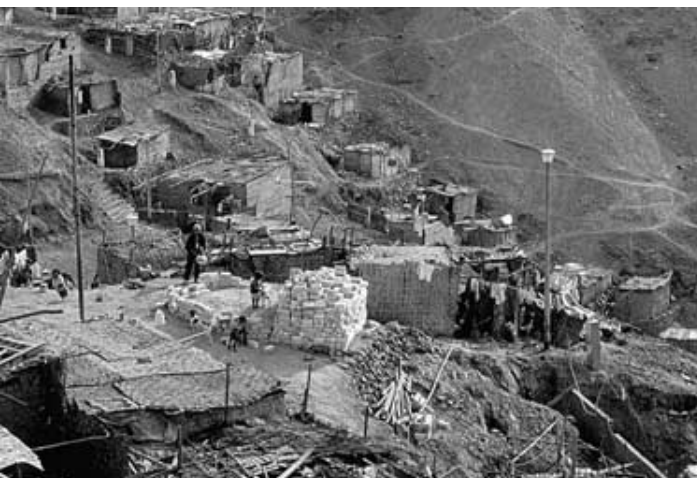
Urban vulnerability: a hillside urban slum in Lima, Peru