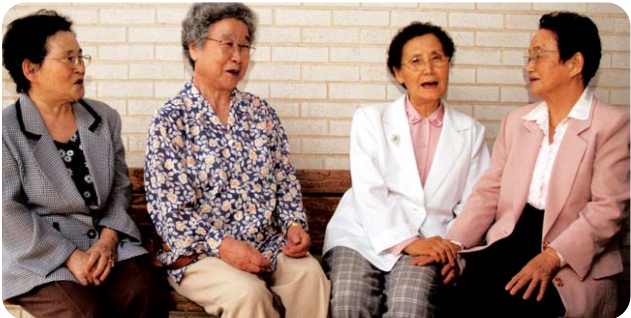
Spending time with friends and family may help keep your memory sharp.