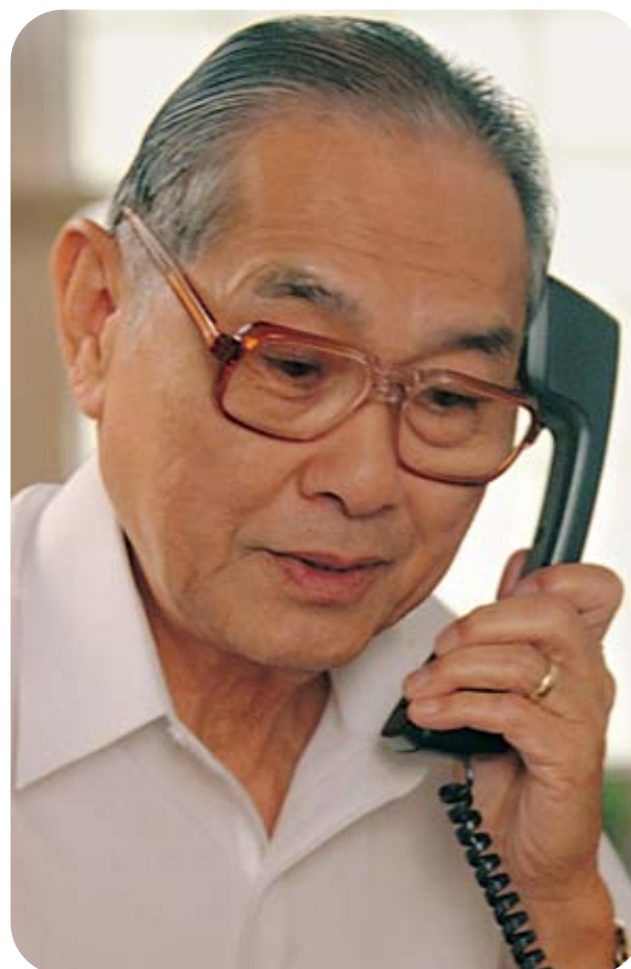
Call for more information.

Families often need information about community resources, such as home care, adult day care, and nursing homes. Contact the Eldercare Locator to find these resources in your area. The Eldercare Locator is a service of the Administration on Aging. It is funded by the Federal Government.