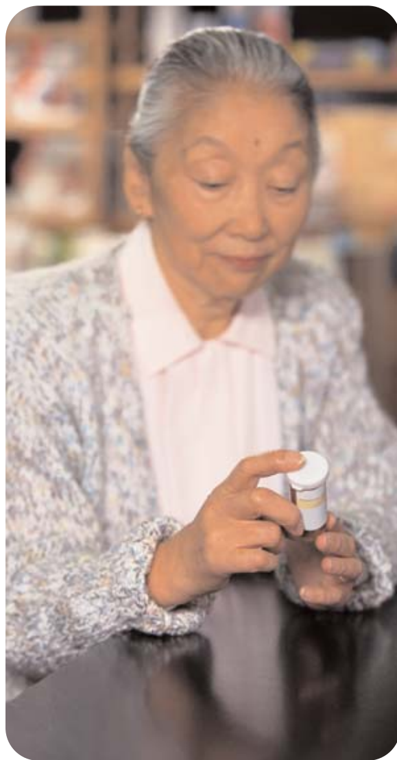
Some medications can help with memory problems.

See page 15 to learn where you and your family can go for help and information.