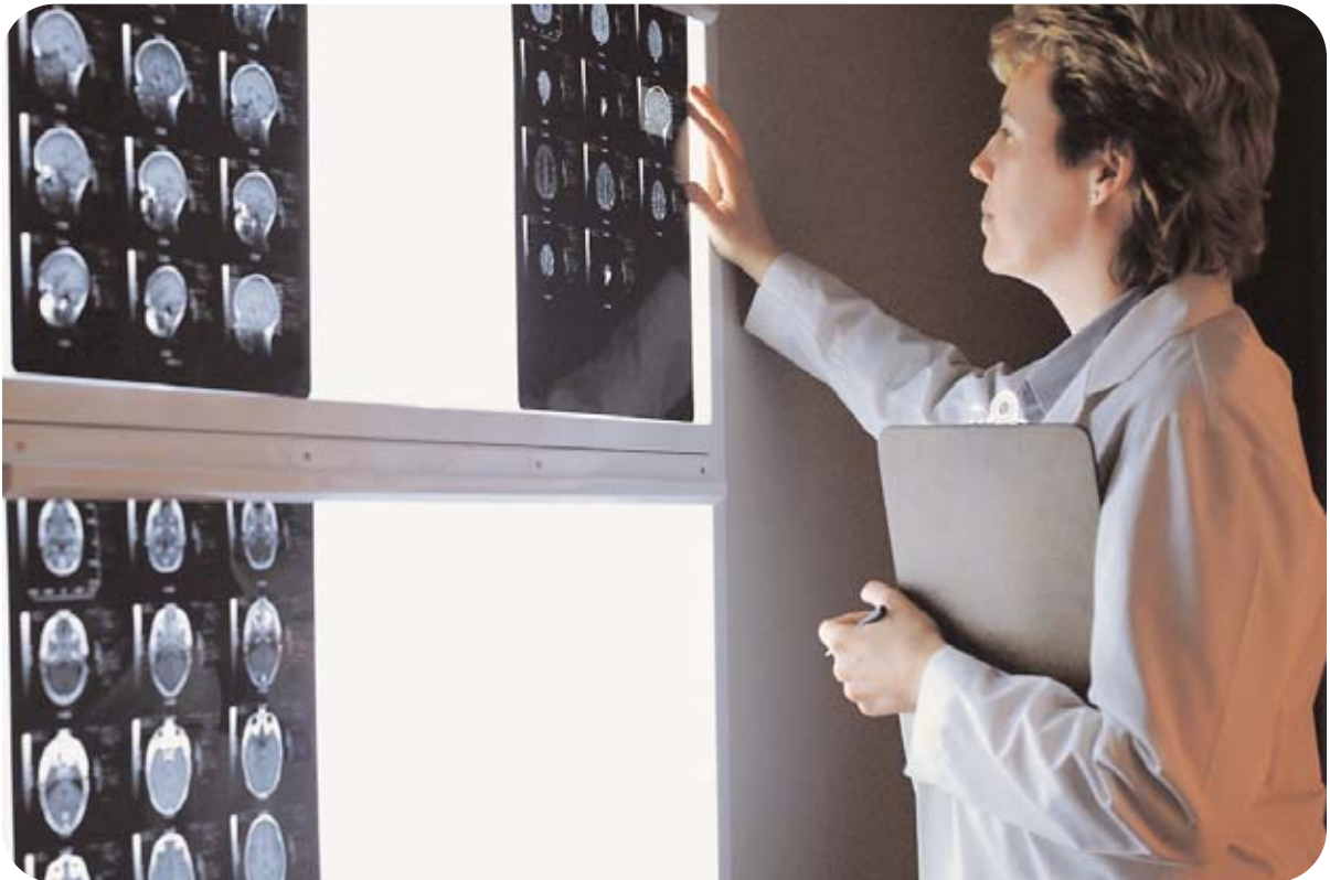
Doctors can check for some causes of memory problems using CAT scans.

See your doctor. If your doctor thinks it's serious, you may need to have a complete checkup, including blood and urine tests. You also may need to take tests that check your memory, problem solving, counting, and language skills. In addition, you may need a CAT scan of the brain. These pictures can show normal and problem areas in the brain. Once the doctor finds out what is causing your memory problems, ask about what is the best treatment for you.