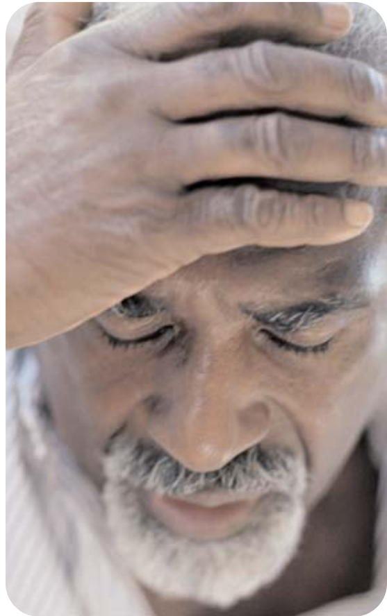
Feeling very sad and worried may cause serious memory problems.

Some emotional problems in older people can cause serious memory problems. Feeling sad, lonely, worried, or bored can cause you to be confused and forgetful. Being active, spending more time with family and friends, and learning new skills can help. You may need to see a doctor or counselor for treatment. Once you get help, your memory problems should get better.