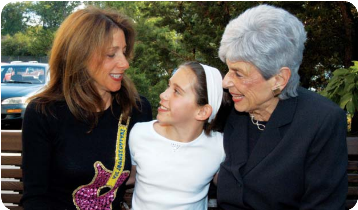
Family and friends can help support you.