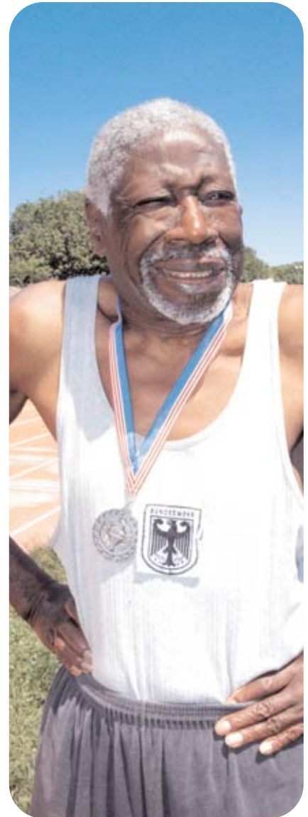
Even active people can have memory problems.