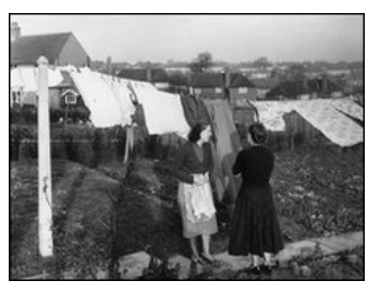
George Cadbury gave the estate to the Bournville Village Trust in 1901

Northfield and built The Beeches, where children from the city slums could holiday.