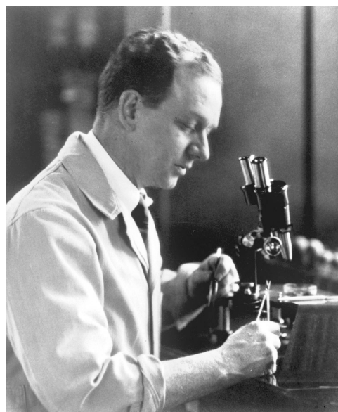
Figure 1. Peyton Rous in 1923. Van Epps, 2005. J. Exp. Med. http://dx.doi.org/10.1084/jem.2013fta

Rous's most famous discovery was finding that a sarcoma in the domestic fowl was transmissible to other fowl by a tumor extract that he had passed through a filter too fine to contain chicken cells or bacteria. In other words, the tumor-inducing agent was a "virus," which later became known as RSV. The importance of this finding was twofold. First, it demonstrated clearly for the first time that a malignant tumor could be induced by infection. Many other examples of tumor-inducing viruses in rabbits,