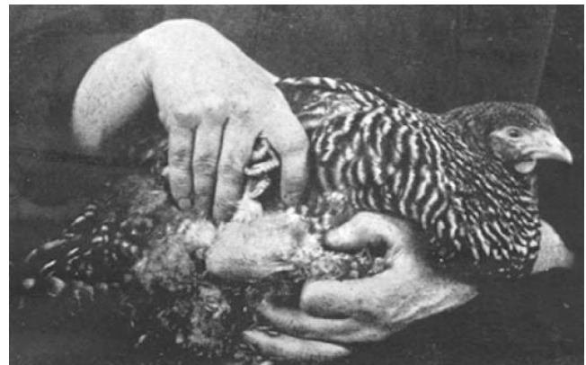
Figure 2. The original Plymouth Barred Rock fowl bearing the tumor presented to Rous and held by somewhat arthritic hands. Reproduced from Rous, 1910.

It is interesting to return to the step by step progress of Rous's research. Rous (1910) became interested in the transplantability of tumors when a woman came to the Rockefeller Institute with a Plymouth Barred Rock hen with a large tumor (Fig. 2). At that time, highly inbred mice were not yet available, although Loeb (1901) had started to experiment on tumor transplantation with a sarcoma in a partially inbred line of white rats. The canine transmissible venereal sarcoma (Novinski, 1876) was the only tumor to be naturally