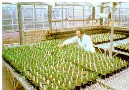
Resistance screening tests in progress in a glasshouse.

The most widely used test for resistance involves growing plants from seeds collected from the suspect field, and spraying them with herbicides applied either at a single discriminating dose, or a range of doses. Such assays are usually conducted in a glasshouse or controlled environment chamber. Assessments usually involve visual assessments of mortality or plant vigour, or measurements of fresh or dry weight of foliage.