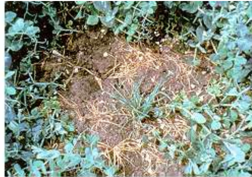
Living plants next to dead plants may indicate developing resistance

Because so many factors may be responsible for inadequate herbicide performance, it is often difficult to determine the exact cause of herbicide failure in the field. Although it is rarely possible to confirm resistance solely on the basis of field observation and consideration of field records, several factors will point in this direction. These are: