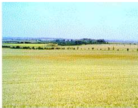
Dense patches of weeds may indicate localised resistance

If resistance is suspected, a sample of seeds (or plants) should be collected from the suspected resistant weed population for a resistance confirmation test.