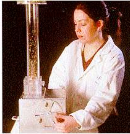
The quality of seed samples can be greatly improved by the use of an air column cleaner.