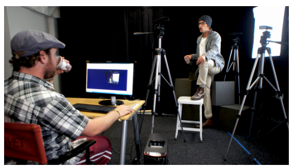
Figure 2 A director tests a refined version of the Thales team's Dark Horse scene-capturing setup, including multiple Microsoft Kinects and a compilation of software.

The directors and actors who tried it were immediately excited and intrigued by the possibilities, and the team was off and running in the new direction, electing to refine their Dark Horse direction for their final product. In the final implementation, they integrated hardware and software into the technology developed for their Dark Horse to capture and replay movies.