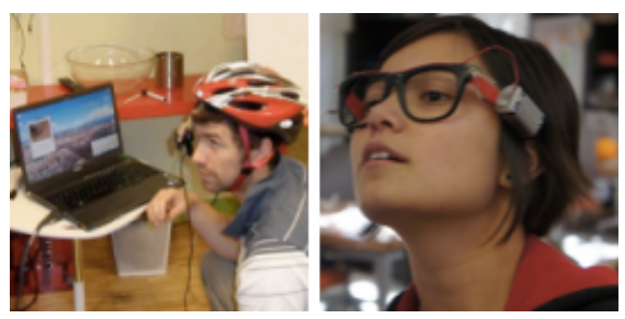
Figure 1 ParisTech and Stanford students test a helmet and glasses that shift the focus and perspective of an image based on the user's movement, elements of the team's initial product vision.

By the end of the first term of the project, the team had settled on a movie viewer-centric approach to the project prompt. They had great success with two early prototypes: 1) A focusshifting prototype involving webcam motioncapture technology in a helmet and selectivefocusing software to allow a viewer's eye movement to control an image's focus and 2) A perspective-shifting prototype involving infrared sensors in a pair of glasses to track a viewer's head movement and display an image in the corresponding perspective. Thev combined these prototypes into a single vision that they planned to move forward with: To create an immersive movie-watching experience in which the viewer's head and eye positions affect both the perspective and focus of a scene (Figure 1).