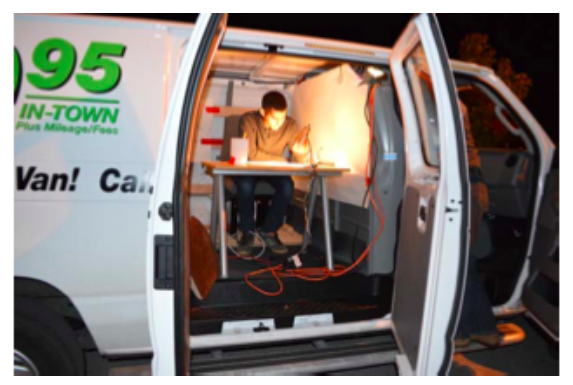
Figure 6 A user tests the Audi team's Dark Horse prototype, a simulated autonomous vehicle that allows for extreme "automatic" custom furniture configuration.

of was dark because the technical challenge: Pop-up pneumatic furniture that automatically morphs the cabin into a space completely customized to its occupants and their activities. "We didn't even prototype it. Not feasible," one of the team members described the engineering necessary to achieve the grand vision in two weeks. Instead, they were able to test the vision in a far faster manner with a clever simulated experience. The team rented a U-Haul van, presented passengers with an interface that allowed them to select their cabin configuration for a specified trip, and quickly outfitted the van with the desired configuration by the time the passenger opened the door (Figure 6). The concealed driver, voice masked by computer, asked passengers about additional desires (like food and magazines) en route, giving a personalized autonomous drive experience.