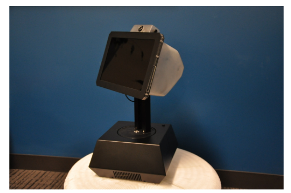
Figure 5 The Swisscom team's final functional prototype, a videoconferencing unit that allows participants to control the viewing angle remotely. This critical design element evolved directly from their Dark Horse prototype.

The team tried a radical idea of a flying blimp videoconferencing system and succeeded in creating it. They used the innovative ideas of user-controlled movement and a philosophical model of "guest" and "host" to focus their innovation. This is an example of the dark horse leading to a nugget of innovation that can be used in a real product.