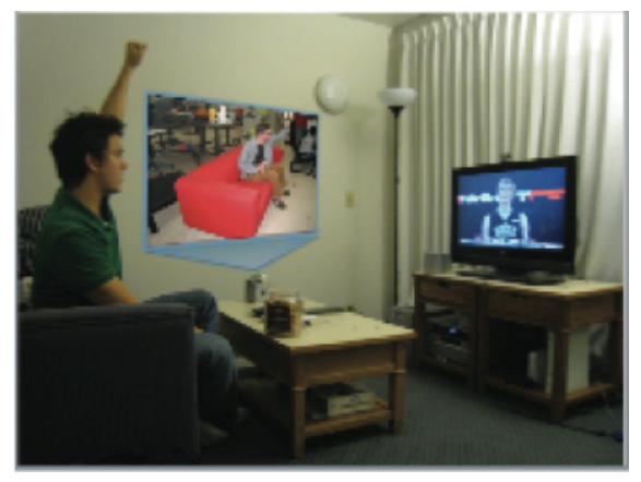
Figure 3 The Swisscom team's initial product vision, a video-recording system that is ambient rather than restricted to a single location or device.

In 2009 a Stanford student team paired with the University of St. Gallen in Switzerland was working with Swisscom AG, a major Swiss telecommunications provider. The problem statement was to "reinvent video communication to make it more appealing to users in the consumer market." The team had begun an exploration into camera placement and viewing on each side with their initial prototypes based on user feedback. They found that screen distance and vertical placement were important, and that a single view was less distracting. The resulting overall product vision was an integrated system in a person's home that would capture video of the user in the room so that they were not restricted to a device in any one place. Figure 3 shows an image the team created to communicate their vision in a brochure.