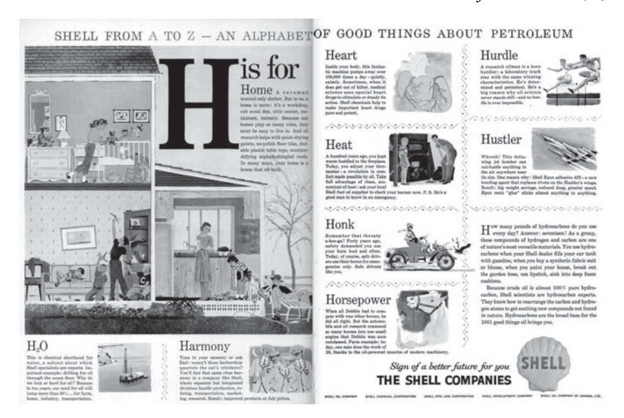
Figure 2. 1956 Shell advertisement.

tying oil to an overwhelming set of basic everyday products - food, plastics, medicine, clothing, and energy - to create a sense of the unavoidability of oil within that space of freedom. During the late 1940s and 1950s, the petroleum industry began to promulgate a narrative best summed up in Esso's (later Exxon) tagline of the early 1950s – "petroleum helps to build a better life." 45 Life itself - always imagined as the life of white nuclear families in the suburbs – was seen as comprising multiple building blocks in which petroleum products were implicated at every stage. Indeed, the idea of an American standard of living came to be equated with petroleum consumption. A particular ad offered this fun fact: "Did you know - that a nation's progress (and their standard of living) can be measured pretty well by its consumption of petroleum?"46 Petroleum, called a "chemical wonderbox" on a national television celebration of the seventy-fifth anniversary of Standard Oil in 1957,47 became constitutive of a whole set of lived practices and visions of the good life.