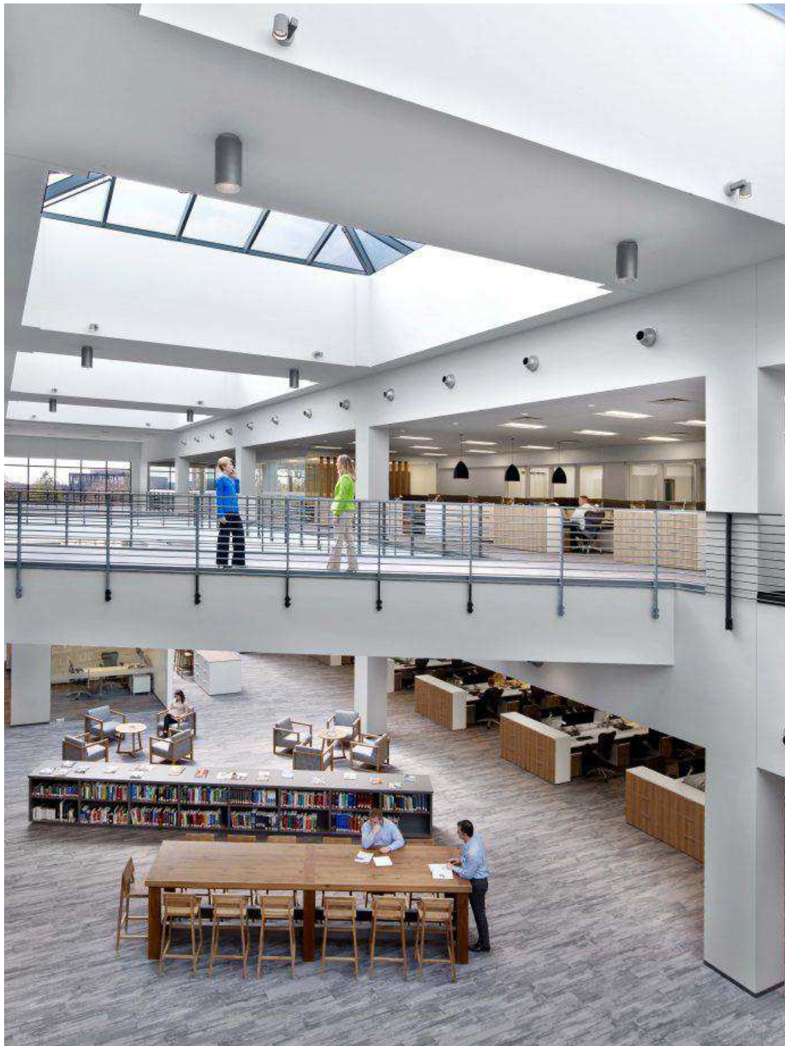
Skylights draw natural light into a common reading room where staff can meet, reflect, and collaborate.