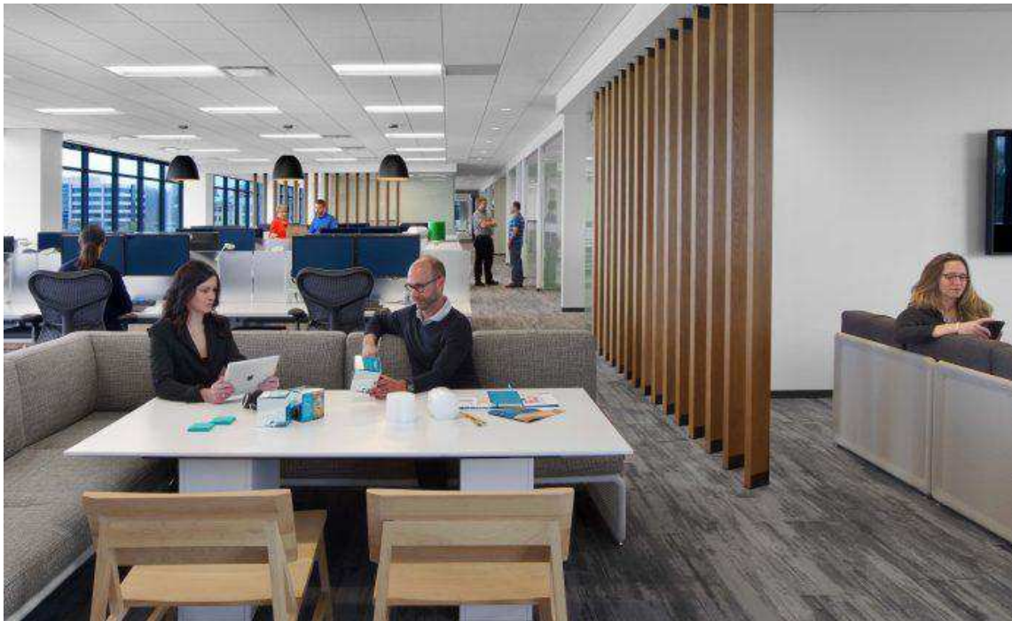
Informal meeting areas located within neighborhoods encourage teamwork and impromptu conversation.

To celebrate curiosity and promote interdisciplinary research, the design arranges all labs in functional clusters instead of divisional boundaries. These clusters include engineering, electronics, industrial, showcase and traditional wet labs.