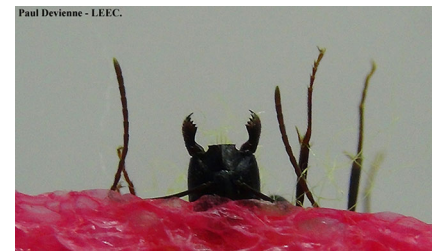
A harnessed ant with open mandibles.