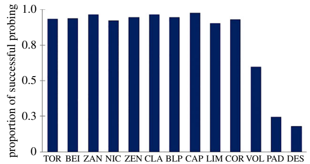
Figure 2. Proportions of successful probing by each monkey of the SCNP group. All males; females did not use probes. (Online version in colour.)